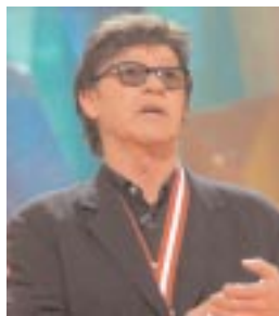
Robbie Robertson LIFETIME ACHIEVEMENT Legend of the rock era, a film composer and record executive.