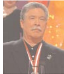
Thomas King ARTS AND CULTURE Author, University of Guelph academic and creator of Dead Dog Café .