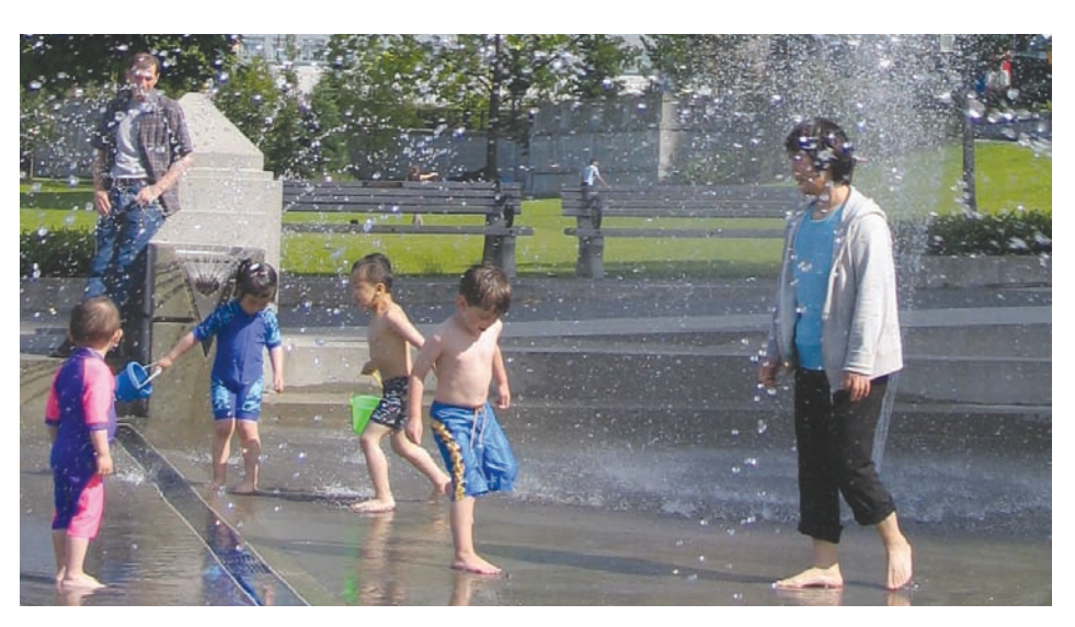
Houston residents now have more time to enjoy the outdoors with their recently upgraded water and wastewater systems.

Infrastructure Program helped solve this water problem and provided a sense of relief to the residents of Houston. The community's water system will receive a major upgrade with the federal and provincial governments each contributing $350,000 towards this $1 million initiative. The upgrades will strengthen the community's ability to fight fires with a newly renovated water distribution system. The improved water and wastewater treatment facilities will service 900 households and lift the recurring seasonal boil water advisory that has been issued since April of 2002.