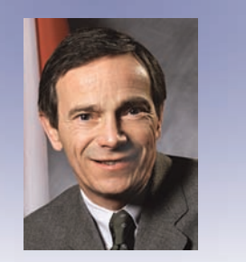
The Honourable Stephen Owen, P.C., Q.C., M.P. Minister of Western Economic Diversification and Minister of State (Sport) Government of Canada