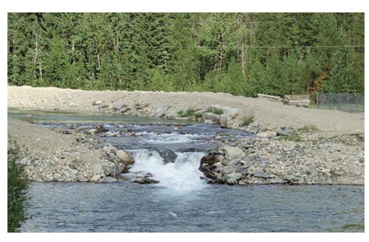
The rushing waters of Swift Creek will provide the community of Valemount with clean water with the help of their new water storage and filtration system.

For more information about the Canada - British Columbia Infrastructure Program, please visit the following: