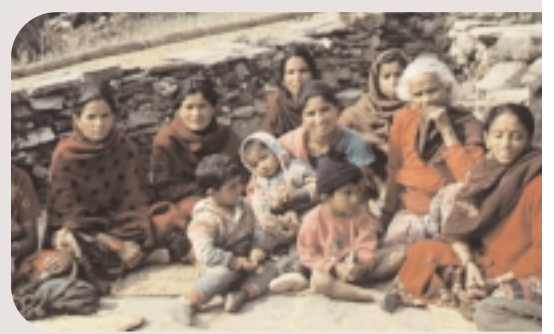
The Srijanshil Mothers' Group, Marangche (Nepal).

grains fall. So we want a crop variety which does not lose its grains before the harvest. We obtained those new varieties. And this year it was hard to separate the grains from the stalks."