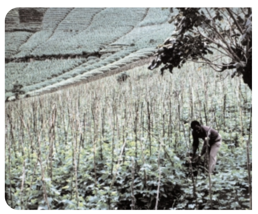
In Central Africa, farmers grow up to 30 different varieties of beans in the same field.

Today, 10,000 years after the invention of agriculture, much of agricultural plant biodiversity no longer exists in the plains. Instead, it has found refuge in the mountains. The question is: How long can it continue to hold out?