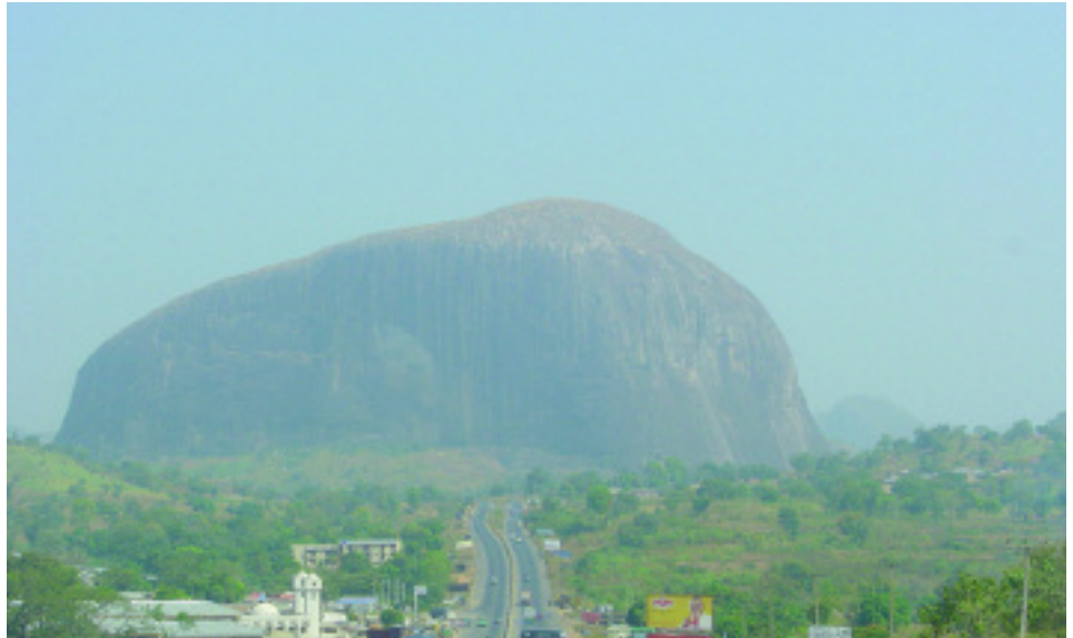
Zuma Rock just outside Abuja, Nigeria's capital since 1991

On the political side, ever since the return of democracy to Nigeria in 1999, Canada and Nigeria have had a strong and warm relationship. Nigerian companies are always looking to see more participation by Canadian companies in their economy, and this goodwill can be a definite advantage.