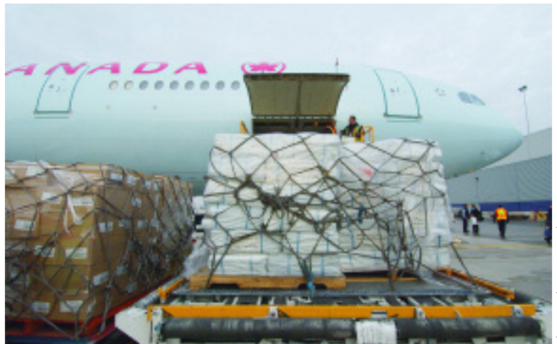
Canadians are getting on-board: An Air Canada A340 headed for Jakarta is filled with much-needed supplies.

For their part, many Canadian companies have come forward to help the victims of the tsunami. The world's leading fertilizer producer, Potash Corp of Saskatchewan Inc., announced it would donate some $1.2 million. Brampton, Ontario-based Nortel Networks and its employees have provided more than $1 million in assistance. Mining company Inco and its Indonesian subsidiary, PT International Nickel Indonesia, have provided $540,000, and Telus, Canada's second-largest telephone service provider, donated $500,000. Canadian Tire, Home