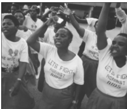
CIDA Photo: David Barbour, Zimbabwe

Social mobilization is important in finding solutions to social problems such as AIDS.