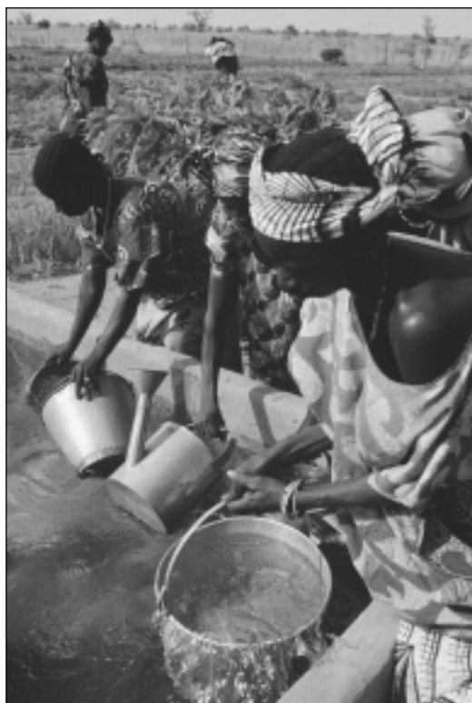
CIDA Photo: Pierre St-Jacques, Mali

Access to water is essential for family needs and food production.