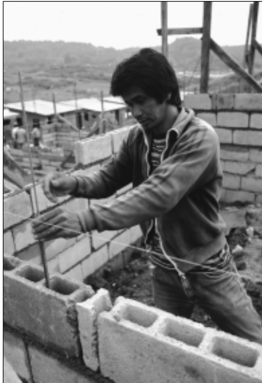
CIDA Photo: David Barbour, Philippines

Good housing conditions are often a basis for health and well-being.