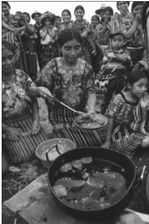
Guatemala

businesses and so on) and citizens have responsibilities in this regard as beneficiaries or agents in producing services. Experience shows that participation by individuals and groups concerned allows appropriate response to people's needs, increases the sense of ownership, and ensures the sustainability of activities. This is particularly true of the participation of women. CIDA has conducted a review of its experience and potential in this area (see Annex III: References).