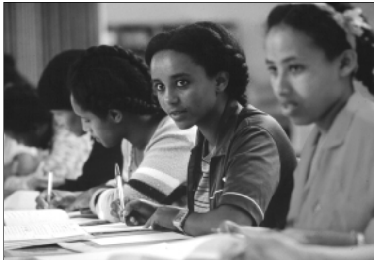
CIDA Photo: David Barbour, Ethiopia