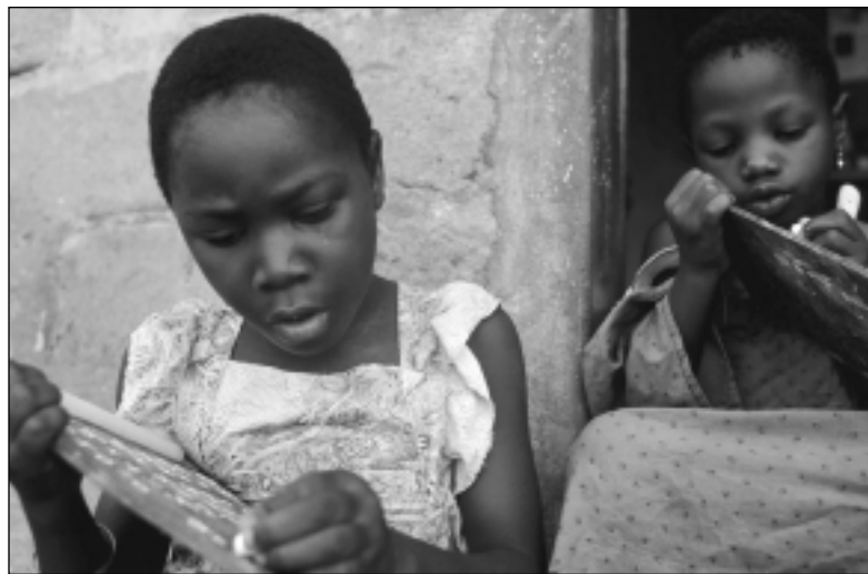
Benin

◆ Using Canadian expertise with comparative advantages – The use, availability and adaptability of Canadian expertise will be favoured for partnership, bilateral and multilateral programs. Niches where this expertise is most appropriate must be determined on the basis of developing country needs, Canada's comparative advantages, and potential multiplier effects in terms of results and impacts.