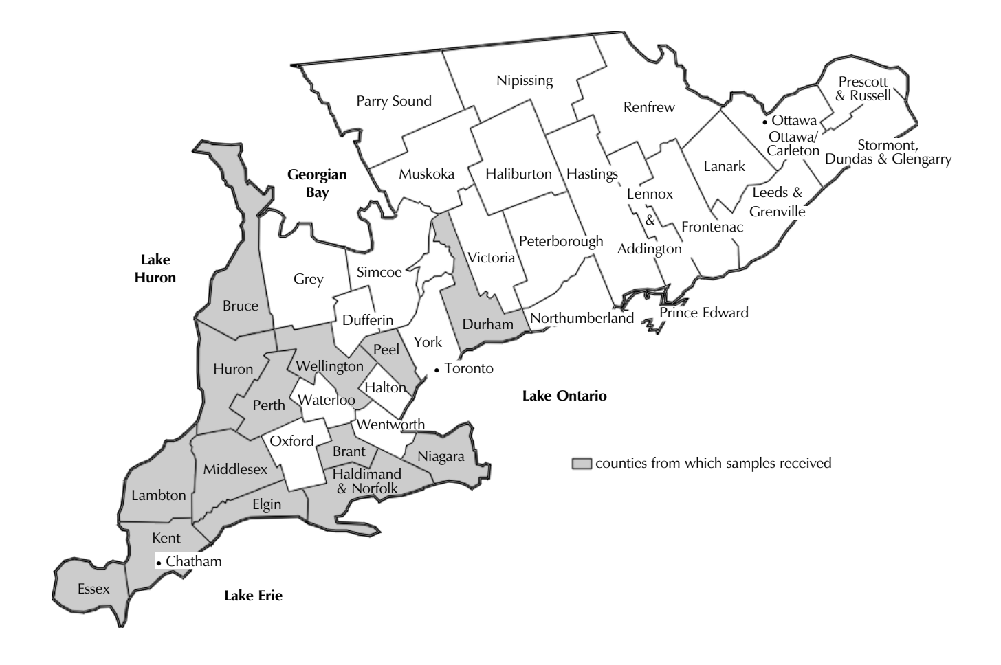
Figure 1 • Map of southern Ontario showing counties from which 1998 soybean survey samples were received