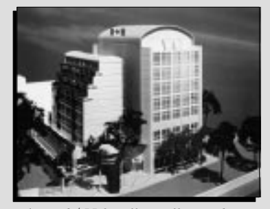
Planned $55.2 million office and residential complex in Seoul, South Korea

31.18 We examined six projects, described in Exhibit 31.1, which are being delivered by the Department of Foreign Affairs and International Trade in four missions. These projects have capital