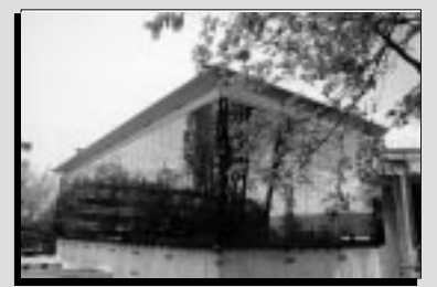
$20.0 million new Canadian chancery in Geneva, Switzerland