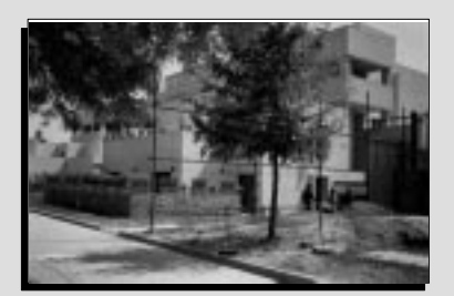
18 new staff quarters costing$9.1 million in New Delhi, India

1993, with completion in September 1996. The project was delivered on budget and approximately five months behind schedule.