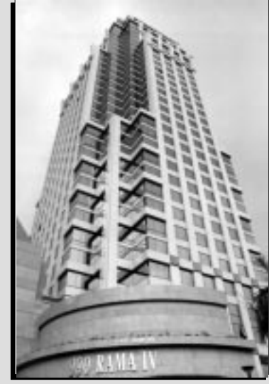
$3.2 million fit-up of the chancery in a new leased building in Bangkok, Thailand

4. The New Delhi official residence project comprised a major reconstruction of the 65-year-old residence to replace various building components and systems, notably the roof, plumbing, air conditioning and electrical systems. The project was approved in June 1996 at an estimated cost of $1.3 million and with a completion date of June 1997. The total cost of the project was $1.5 million and it was delivered on schedule.