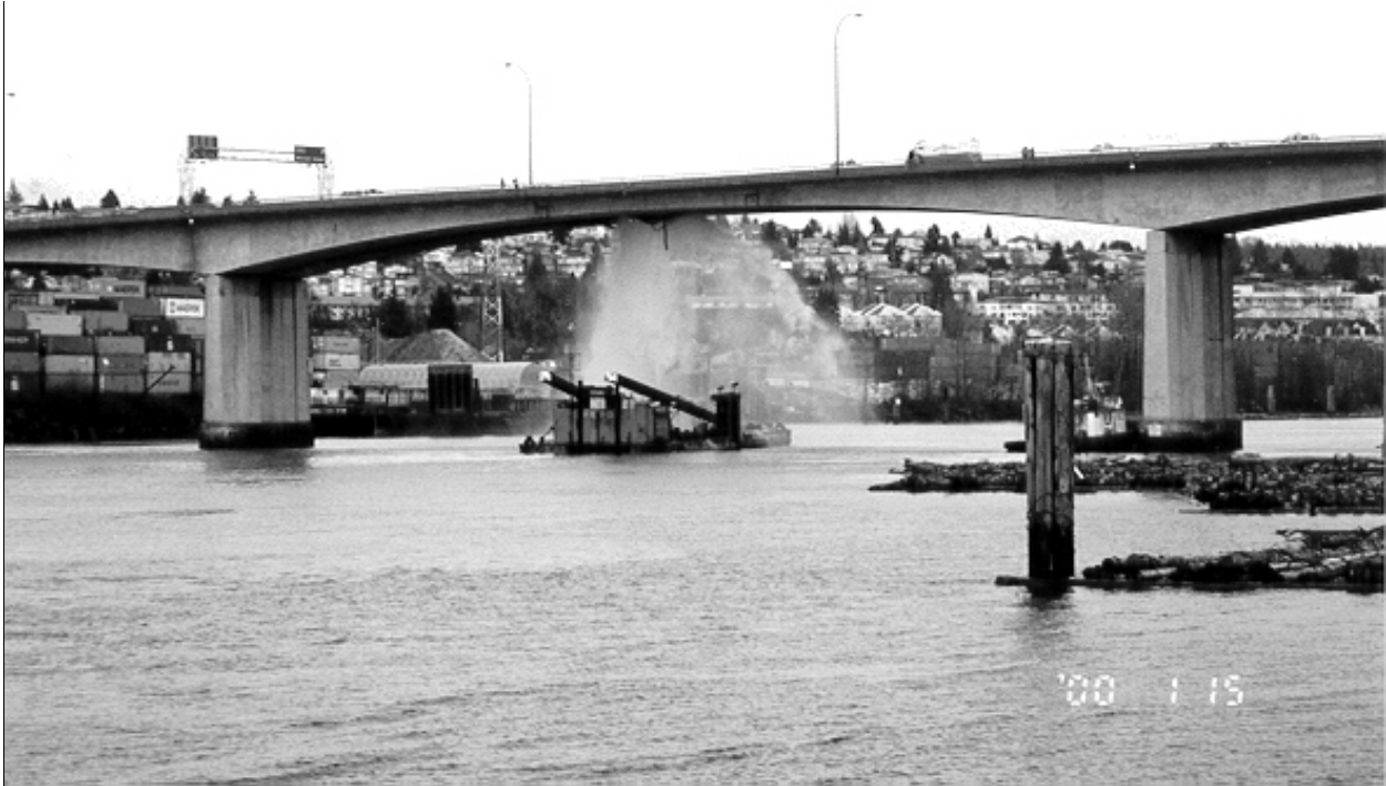
The Knight Street Bridge South seen from the west immediately after the occurrence. The barge "T.L. SHARPE" with spuds in the cradle and pointing forward is "anchored" under the bridge by the sunken crane astern. Water is escaping from the broken pipe.

bridge the crew heard a crashing sound. When they looked back they saw the boom swaying and buckling. The top of the boom was scratching against the underside of the concrete span. Bits of concrete were falling onto the barge, followed by water from an overhead pipe. The skipper reduced propulsion to slacken the pull; however, the barge still had some momentum and the crane, with the top of the boom wedged under the bridge, shifted off the deck and sank astern of the barge.