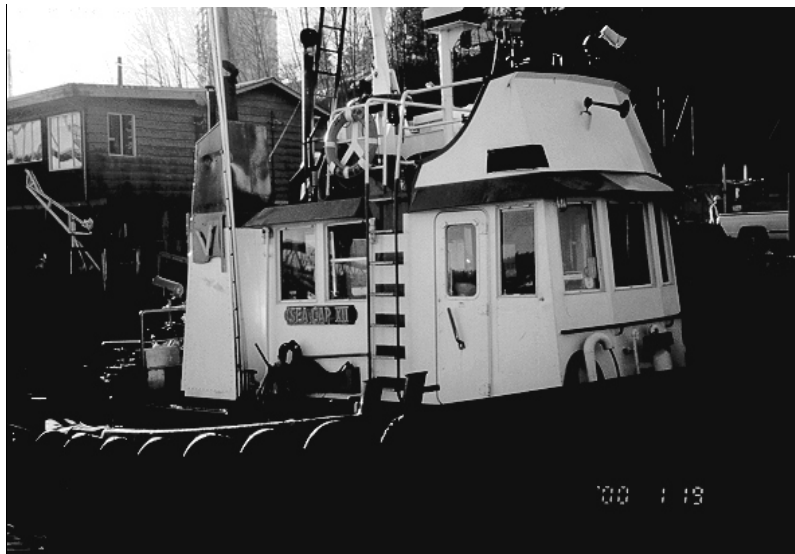
"SEA CAP XII"

The "SEA CAP XII" is a small steel tug used mostly in the Fraser River, and occasionally for some light duties in the waters of the Strait of Georgia. It has two propellers in Kort Nozzles and four rudders connected by a bar. At the forward end of a midship deck-house is a control panel with navigation, steering and engine controls; at the after end is a galley. The deck-house, fitted with windows on all four sides, has an almost 360-degree view from the inside. The door leading to the stern of the tug is partially glassed. There are two