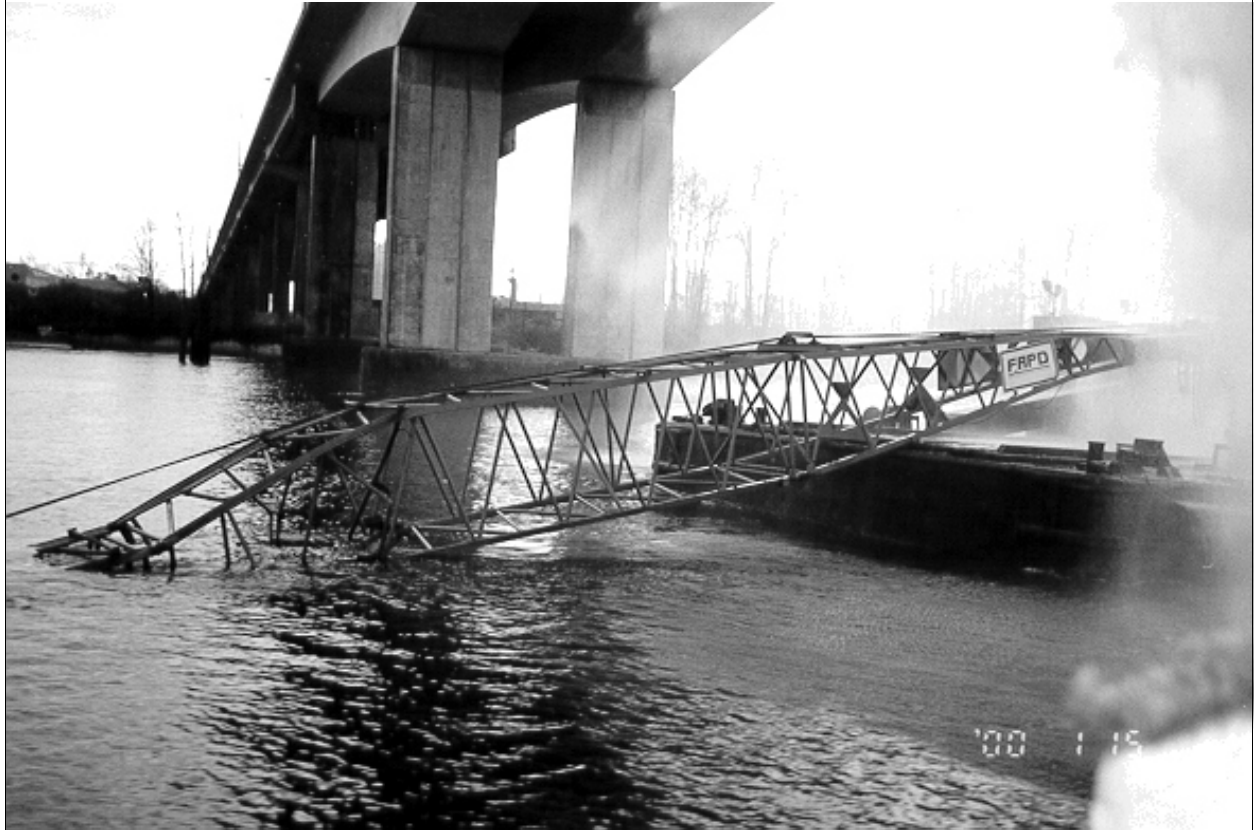
The crane moved off the barge's deck and sank under the bridge with its boom, bent during the striking, extending above the surface.

The post-occurrence report by the British Columbia Ministry of Transportation and Highways contains a detailed damage assessment. The bridge remained closed to all vehicle traffic for about 48 hours.