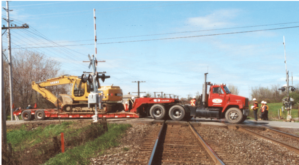
Figure 1. Simulation of truck crossing the tracks at point of grounding out