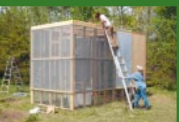
Canadian Wildlife Service

The HABITAT STEWARDSHIP PROGRAM funds activities that are necessary to recover species (such as habitat improvement and restoration, outreach, and land securement).