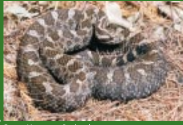
John Mitchell Eastern Massasauga Rattlesnake

SPECIES RECOVERY TEAMS are formed through partnerships among government bodies, First Nations, Conservation Authorities, individual volunteers, and non-government organizations of all sizes and capacities. These teams put official recovery strategies into action. The stewardship activities that are needed to recover wildlife populations are often labour-intensive, and recovery would not be possible without the dedication of the teams and individuals who do the on-the-ground work in Ontario's communities.