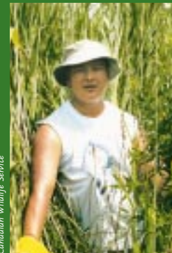
Canadian Wildlife Service

Internationally recognized for the large wetland complex, Long Point was designated as a WORLD BIOSPHERE RESERVE by the United Nations in 1986. The Long Point NWA is the core area of this Reserve.