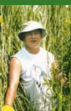
Canadian Wildlife Service

Internationally recognized for the large wetland complex, Long Point was designated as a WORLD BIOSPHERE RESERVE by the United Nations in 1986. The Long Point NWA is the core area of this Reserve.