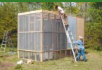
Canadian Wildlife Service

The HABITAT STEWARDSHIP PROGRAM funds activities that are necessary to recover species (such as habitat improvement and restoration, outreach, and land securement).