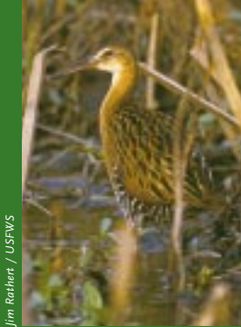
Jim Rathert / USFWS

Several WATERSHEDS in Ontario, including the Grand, Thames, Sydenham and Ausable, provide habitat for a wide diversity of species including endangered and threatened species of fish, mollusks, and reptiles. Many other species, such as the KING RAIL ( endangered ), find refuge in the wetland habitats.