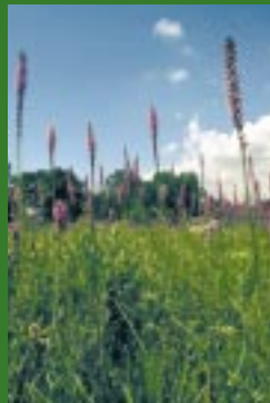
P. Allen Woodliffe

Often overlooked for their ecological importance, TALLGRASS PRAIRIE and SHORT GRASS HABITATS are crucial for the survival of many species of insects, birds and mammals. Walpole Island is one of the few remaining sites in Ontario with Tallgrass Prairie habitat and hosts rare plants such as Showy Goldenrod ( endangered ), Riddell's Goldenrod ( species of concern ) and DENSE BLAZING STAR ( threatened ).