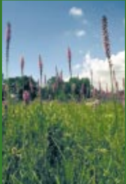
P. Alan Woodruff

Often overlooked for their ecological importance, TALLGRASS PRAIRIE and SHORT GRASS HABITATS are crucial for the survival of many species of insects, birds and mammals. Walpole Island is one of the few remaining sites in Ontario with Tallgrass Prairie habitat and hosts rare plants such as Showy Goldenrod ( endangered ), Riddell's Goldenrod ( species of concern ) and DENSE BLAZING STAR ( threatened ).