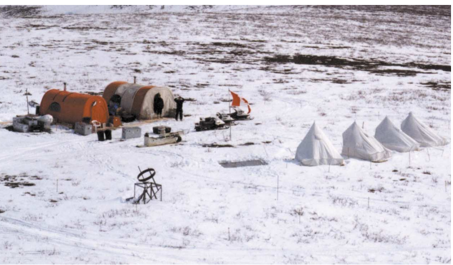
At this field camp north of Inuvik, NWT, researchers study the water cycle to better understand climate trends in the North.

• advancing our knowledge of the climate system (ocean, atmosphere, land and cryosphere