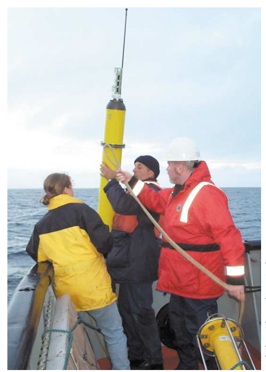
Through the Argo project, monitoring devices aather data from the world's oceans and transmit them via satellite.

Global averages give the big picture, but changes to regional climate help us understand how warming will affect Canadian society and the environment. And while regional changes are still difficult to predict, climate models already reveal that large