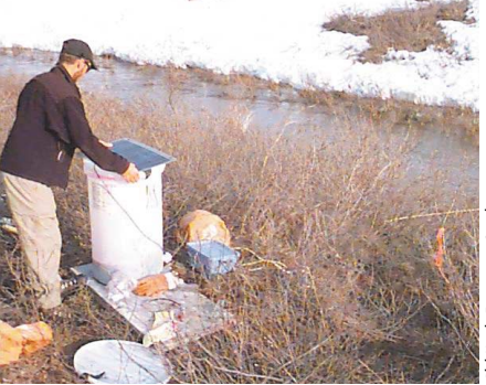
A researcher measures streamflow using dye injection techniques.

This systematic climate monitoring provides valuable information used in developing climate models that project future trends. Tracking changes in temperature will also help to determine the effectiveness of greenhouse gas emission reduction measures.