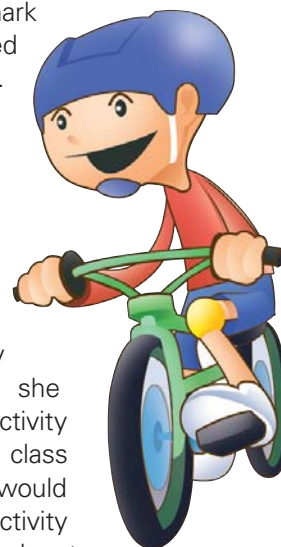
chart and asked all the children to tell her which of the activities listed on it would make them feel the same way. She put a red star beside every vigorous activity and told the children that they needed to increase those types of activities by at least 10 minutes a day.

Now she was ready to issue a challenge to her class. She worked with the children to establish a class goal for physical activity. Every day, each child would put a sticker on the big wall chart she had created for the activity they had done for at least 10 minutes. The class would then total their activities to see how they were progressing. Jennifer would also take at least 10 minutes every day to let the children be active in the classroom. They used their stickers (or wrote) on the wall chart to record this activity. They also recorded their recess activity on the chart.