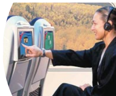
Orleans Express and Alstom/Telecity