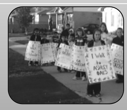
This "Walking School Bus" at Ashley Oaks Elementary School in London is one of the solutions promoted by the Active and Safe Routes to School Project.

MOST relies on an independent multi-stakeholder advisory committee to recommend which projects should receive funding and the amount of each contribution. The recommendations go to the Director General of the Environmental Affairs Directorate at Transport Canada, who has the final decision-making authority.