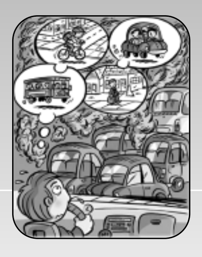
Lâche la pédale!, New Brunswick