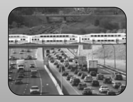
CUTA'S VIP program increased Canadians' awareness of and support for sustainable transportation options.

Project Website: www.cutaactu.ca/content.asp?ID=87