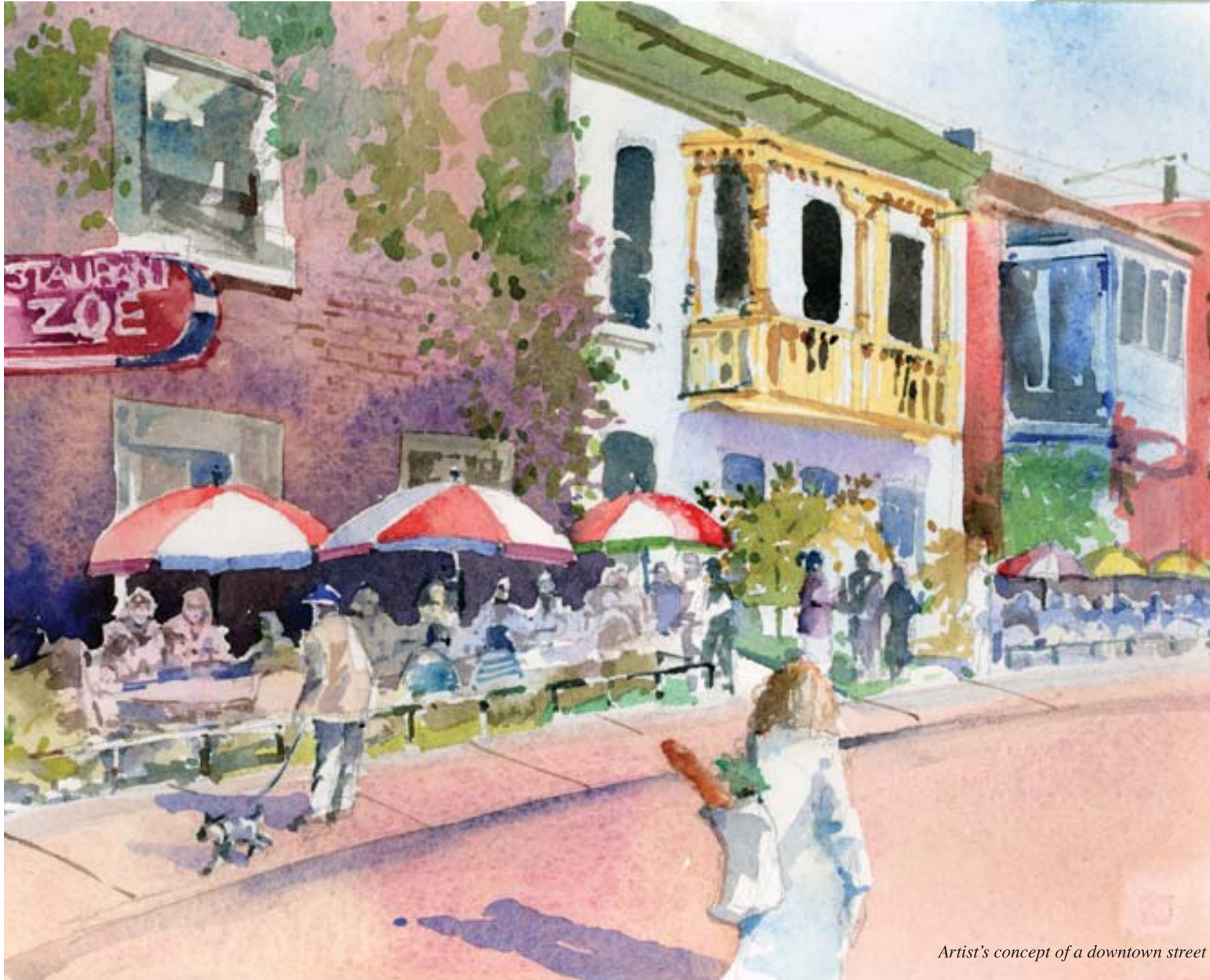
Artist's concept of a downtown street