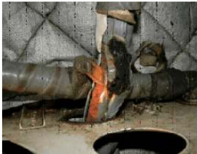
Photo 5. Burned heater ribbon behind aft wall

In addition to the fire damage associated with the occurrence flight, TSB investigators found a burned Cox & Company heater ribbon, protective tape, and Rubatex foam insulation behind the aft wall of the aft cargo area on the occurrence aircraft (see Photo 5). Although a self-propagating fire had not occurred, the area had become hot enough to burn through the Rubatex foam insulation and a nearby plastic clamp.