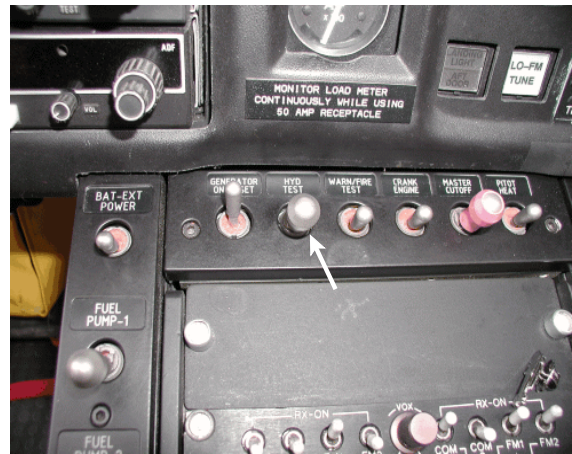
Photo 3. Hydraulic HYD TEST switch

The HYD TEST switch (Photo 3) was found in the forward or “Test” position. The pull-to-unlock design of the HYD TEST switch requires the toggle lever to be lifted up, then over the locking mechanism. Impact marks on the switch indicate that it was likely in the forward position at the time of impact. A continuity check and function testing were performed on the switch and no discrepancies were noted. This switch is powered through the hydraulic CB.