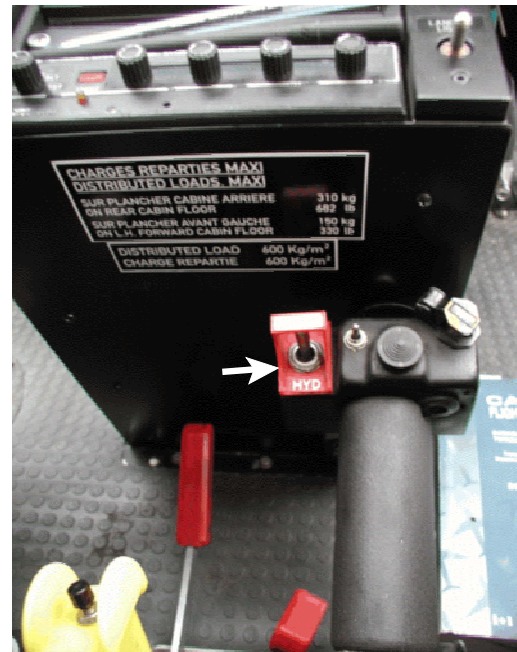
Photo 2. Hydraulic CUTOFF switch and guard

The hydraulic CUTOFF switch (Photo 2) on the collective was found in the forward or normal position. The switch guard was broken by impact forces and the switch housing was bent rearward. Because of the extent of the damage to the switch, the switch position prior to impact could not be determined, nor could the switch be tested for electrical continuity. The switch was disassembled and no discrepancies were noted that would indicate a pre-existing condition that may have prevented normal operation. This switch is powered through the hydraulic circuit breaker (CB).