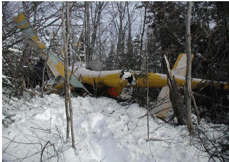
Photo 1. C-GOGN wreckage

At 1143, the pilot reported that the aircraft had experienced a hydraulic failure and described the logging site where he was going to land. He announced as part of his last transmission that he anticipated a rough, spot landing. The helicopter approached the logging site from the west; the logging site was a valley with a rail line running north/south. The helicopter proceeded to the south and then flew northbound over rising terrain east of the logging site (see Appendix A). Once on the east side, the helicopter levelled at approximately 50 feet above the trees, continued on a northerly heading until reaching the north end of the logging site, entered a left turn and proceeded back toward the witnesses. The helicopter remained in the left turn and in a left-banked attitude such that the witnesses, located approximately 600 feet south, could clearly see the aircraft registration markings on the underside of the aircraft. The helicopter descended into the rising terrain and came to rest inverted on a heading of 080° Magnetic. The accident occurred at 1144, at 47° 04' North latitude, 084° 04' West longitude, at an elevation of 1456 feet above sea level (asl) during hours of daylight.