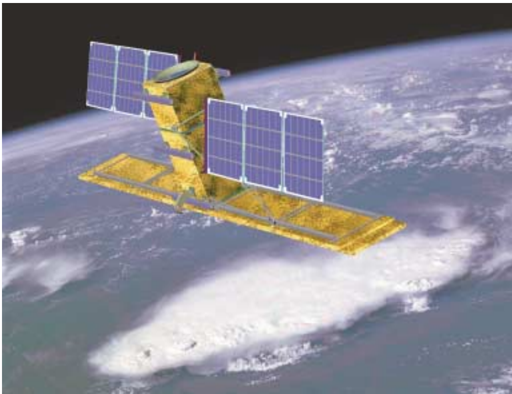
Artist's conception of RADARSAT-2. (© MDA 2000)