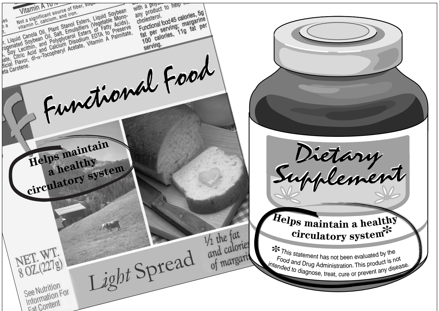
Figure 2: Hypothetical Comparison of Two Products Using the Same Structure/Function Claim—a Functional Food Without a Disclaimer and a Dietary Supplement With a Disclaimer

structure/function claim related to maintaining a healthy circulatory system would have to include the disclaimer on its label, but a functional food containing the same ingredient and claim would not. (See fig. 2.)