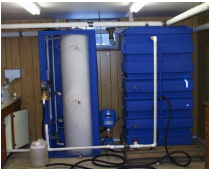
This in-house coagulation system treats 360 L (80 Imp. gallons) of water every 4 hours.

The Floc System 100 has been identified by PFRA as a commercially available in-house coagulation system. The Floc System 100 is a newly developed, compact, commercial water treatment system that is well suited to treat the organic-rich water often found in dugouts, rivers or lakes.