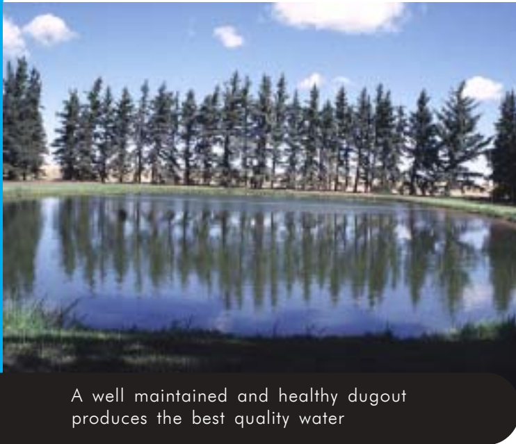
A well maintained and healthy dugout produces the best quality water

Dugouts are miniature ecosystems, containing all forms of life including plants, animals and bacteria. All of these living organisms require oxygen, so an adequate concentration of oxygen in the water is required to maintain a healthy dugout ecosystem. A healthy dugout produces the best quality water.