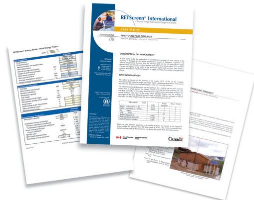
Case studies, with RETScreen analysis and information about the built project