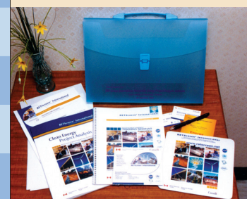
RETScreen training material used by AIT.