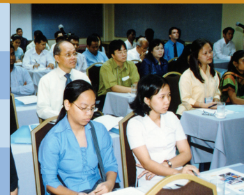
RETScreen training at the Asian Institute of Technology (AIT) in Thailand.