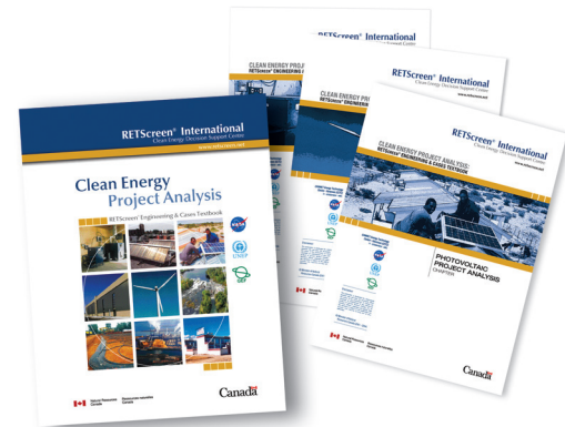
Engineering e-Textbook, with description of RETScreen Software model algorithms