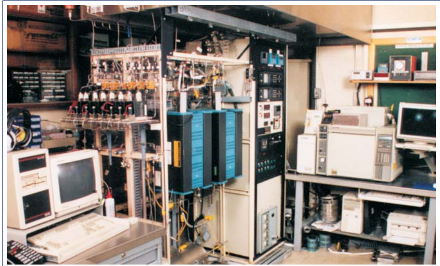
CETC's Membrane Testing Facilities

T he CANMET Energy Technology Centre (CETC) has achieved significant advances in ceramic membrane technology and its application. We believe we have “breakthrough” technology that has great potential for commercialization in Canada. CETC is proud to offer this technology and its know-how to Canadian industrial partners for further commercial development.