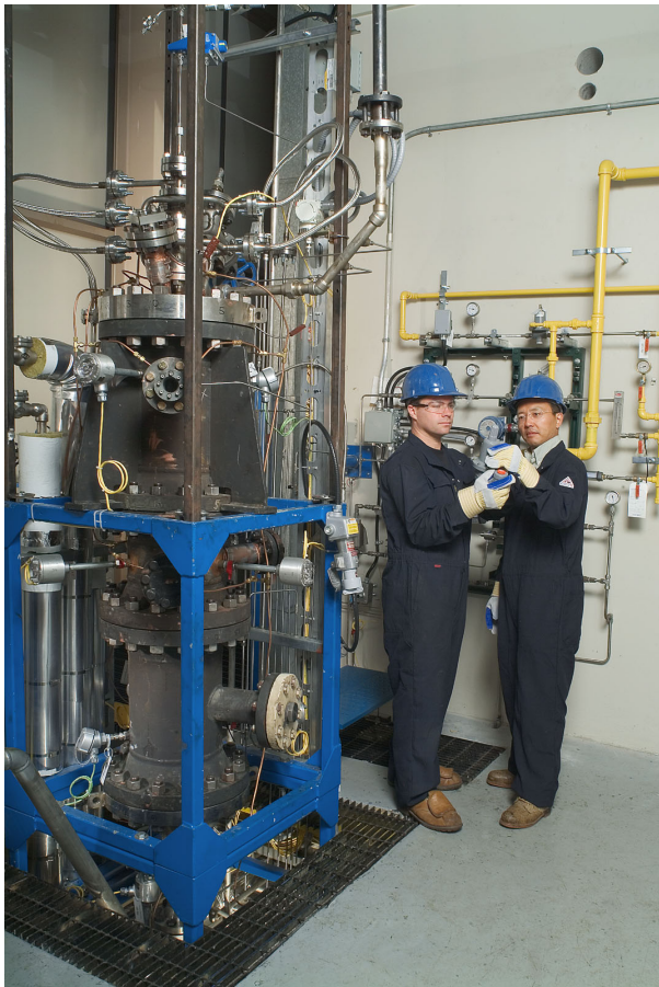
Image above: The CETC-Ottawa gasifier is sectional in design allowing modification to meet client needs.