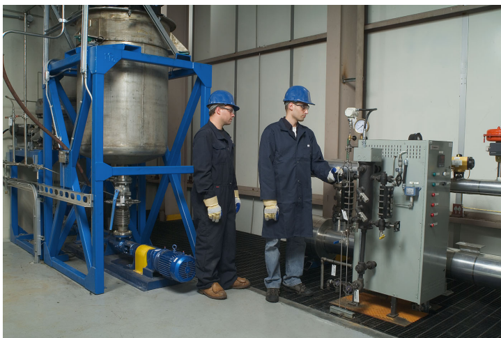
Image above: The gasifier is capable of running with a dry feed or a slurry feed.