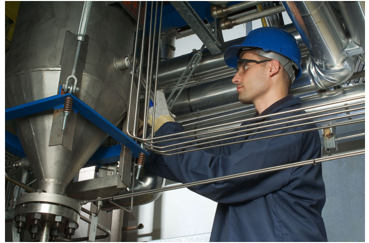
Image below: Oxygen can be supplied to the gasifier at elevated temperatures in order to increase reactivity.