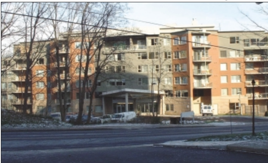
New residential units at Spencer Creek, 2001