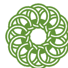
Table ronde nationale sur l'environnement et l'économie

National Round Table on the Environment and the Economy