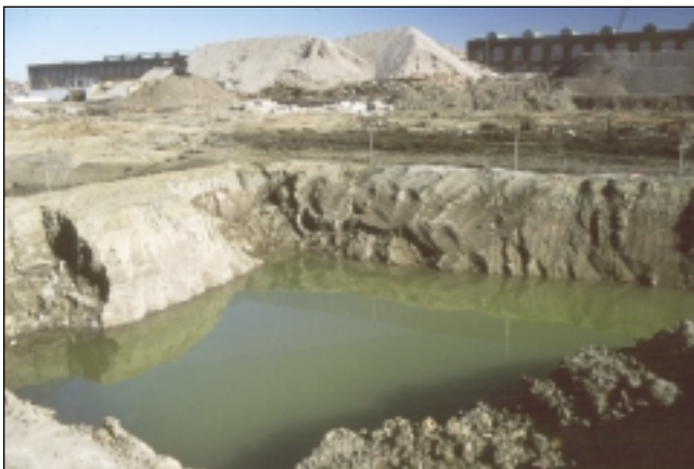
Angus Shops, Montréal, Quebec: Before site cleanup, 1998

The approach seeks to provide greater assurance for all parties—community residents, industry, investors and local governments—that appropriate standards are being applied, that the cleanup is being carried out properly and that the environment is protected.