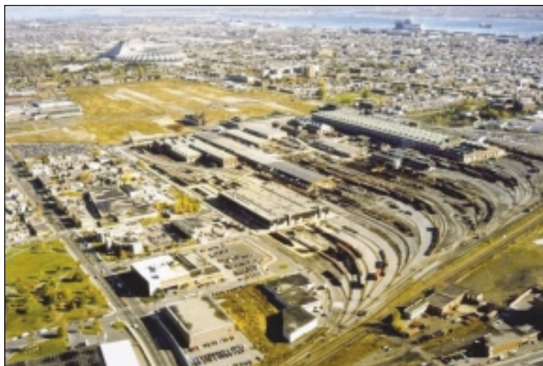
Angus Shops, Montréal, Quebec : half brownfield, half industrial complex, 1978

Brownfield redevelopment has not been a high-profile issue in many communities. There is a general lack of awareness—among all levels of government, the private sector and at the community level—of the challenges and opportunities presented by brownfield redevelopment.