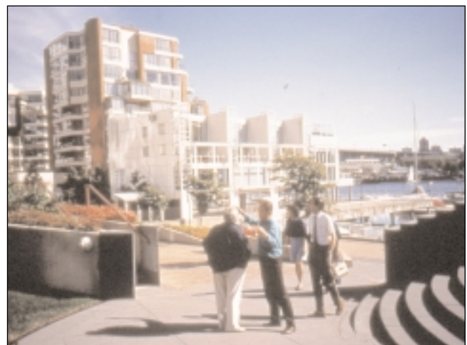
False Creek, Vancouver, B.C., 2002

(For more information on the study, see Annex 3.)