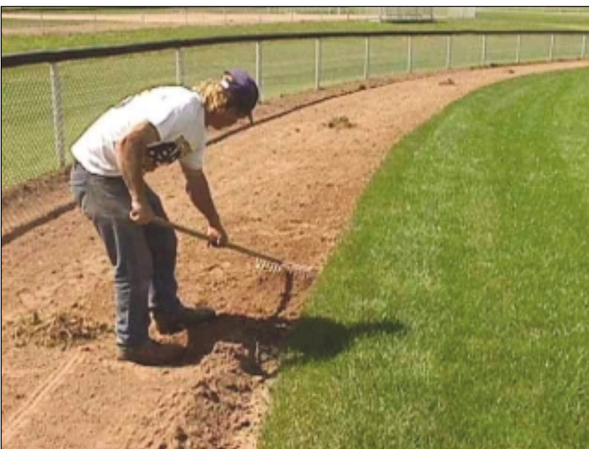
Preparation of the new sports fields at the former Moncton Shops site, 2001