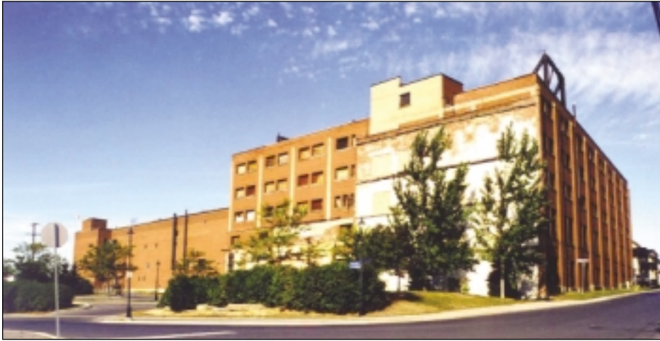
Finishing mill complex before redevelopment, Cornwall, Ontario, 2002

The rationale provided under each of the recommendations identified the strengths and limitations of the individual policy tool being proposed. Annex 5 provides an analysis of the broader universe of potential policy tools from which the recommendations were drawn, and identifies the complementarities and connections among the tools selected for the strategy.