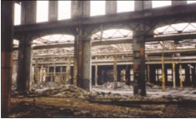
Old foundry buildings before redevelopment, Spencer Creek Village, Dundas, Ontario, 1998