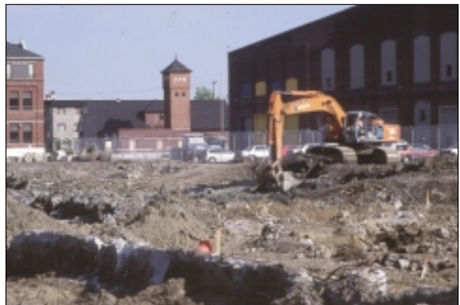
Cleanup at Angus Shops site, 1998