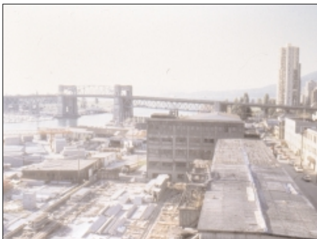
False Creek, Vancouver, B.C., before redevelopment, 1950s

Channelling growth into brownfields instead of greenfields can also contribute to improved air quality and reduced greenhouse gas emissions in urban areas. The redevelopment of older downtown sites provides an alternative to urban sprawl that promotes more compact urban forms and reduces the commuting and transportation requirements of residents, workers and businesses.