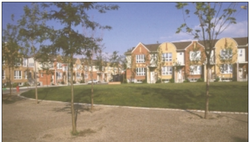
A new neighbourhood on the former Angus Shops site in Montréal, 1999

Current funding models (such as the Federation of Canadian Municipalities' Green Municipal Enabling Fund) should be reviewed, adapted or expanded to accommodate the specific funding needs of brownfield redevelopment. A new grant funding program, involving all levels of government, could be established with criteria for site assessment and revitalization demonstration projects. The criteria should limit the availability of grants to municipalities and non-profit organizations (including properties remediated under the control of these entities) to target those sites where remediation is not market-driven. (For example, a municipality may want to remediate a brownfield site to create a park or build a swimming pool.) However, grant funding could also flow through a municipality or non-profit organization to eligible private sector projects.