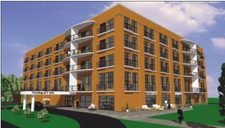
New finishing mill residential lofts