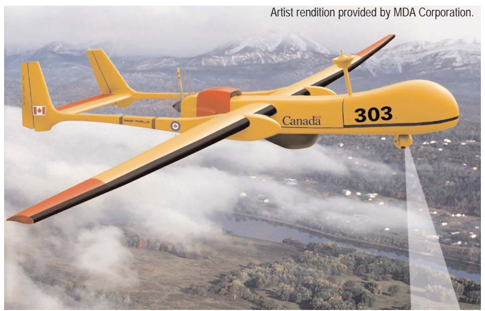
Artist's rendition of the Heron UAV. The potential for search and rescue is the focus for Canada's first ever Unmanned Aerial Vehicle Competition.

The goal of the competition is to help advance the current state of knowledge, technology and use of