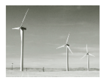
McBride Lake Wind Farm, Alberta