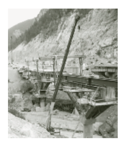
Construction of 5-Mile Yoho Bridge in Kicking Horse Canyon, British Columbia—Strategic Highway Infrastructure Program Project