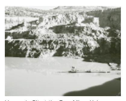
Vangorda Pit at the Faro Mine, Yukon