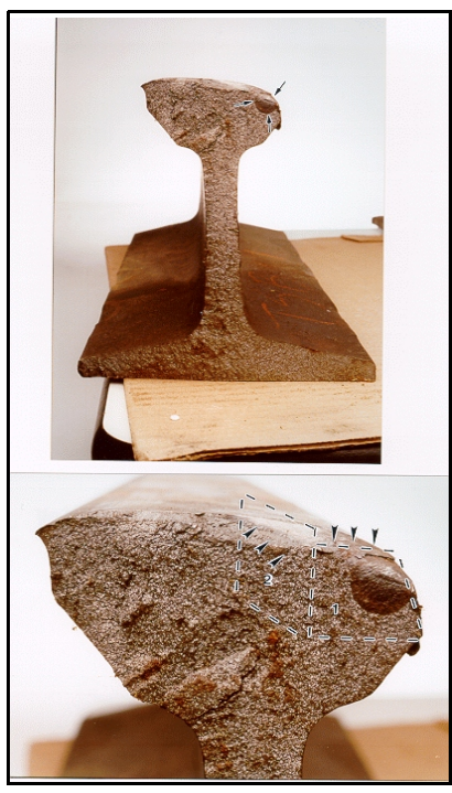
Figure 2 - Transverse defect representing five per cent of the rail fracture surface area.