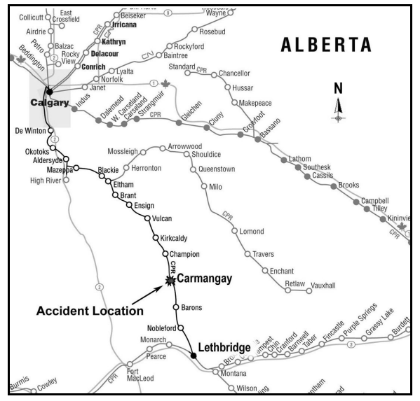
Figure 1 - Map of Southeastern Alberta, showing the Carmangay accident location.

At approximately 1730, as the train proceeded on the main track and was passing over the Carmangay siding north turnout (the Carmangay turnout), Mile 30.2 of the Aldersyde Subdivision, the train experienced a train-initiated emergency brake application and the locomotive engineer observed rail cars derailing to the west side of the track. At the time of the accident the locomotive event recorder indicated that the train speed was 26 mph, the