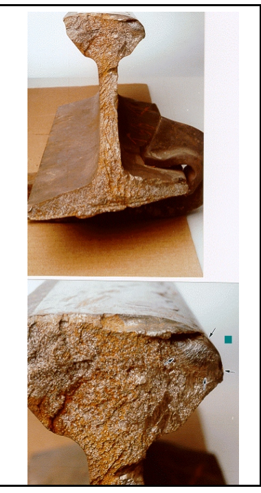
Figure 3 - Transverse defect representing three per cent of the rail fracture surface area.