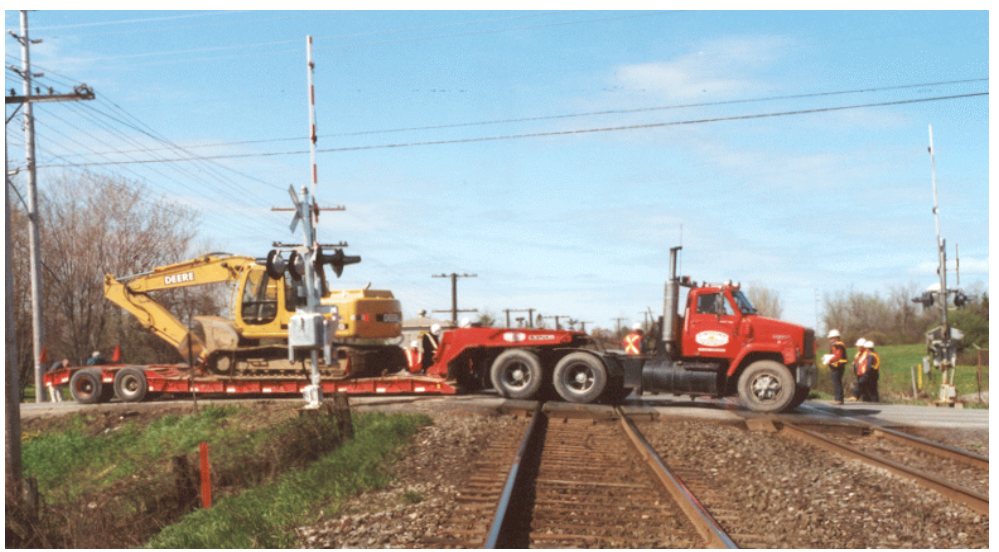
Figure 1. Simulation of truck crossing the tracks at point of grounding out