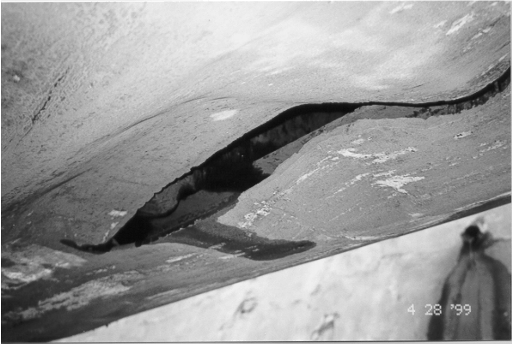
Damage to starboard water ballast tank N°5.