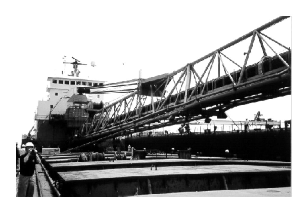
Unloading boom in topped-up position