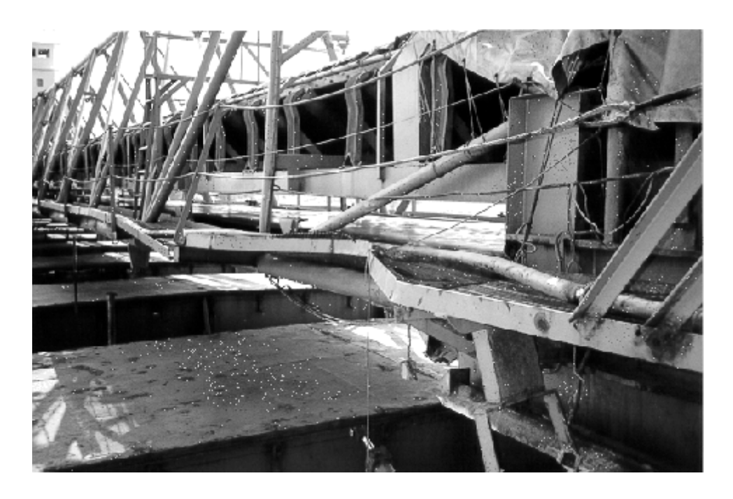
Unloading boom catwalk: damage from contact with light standards