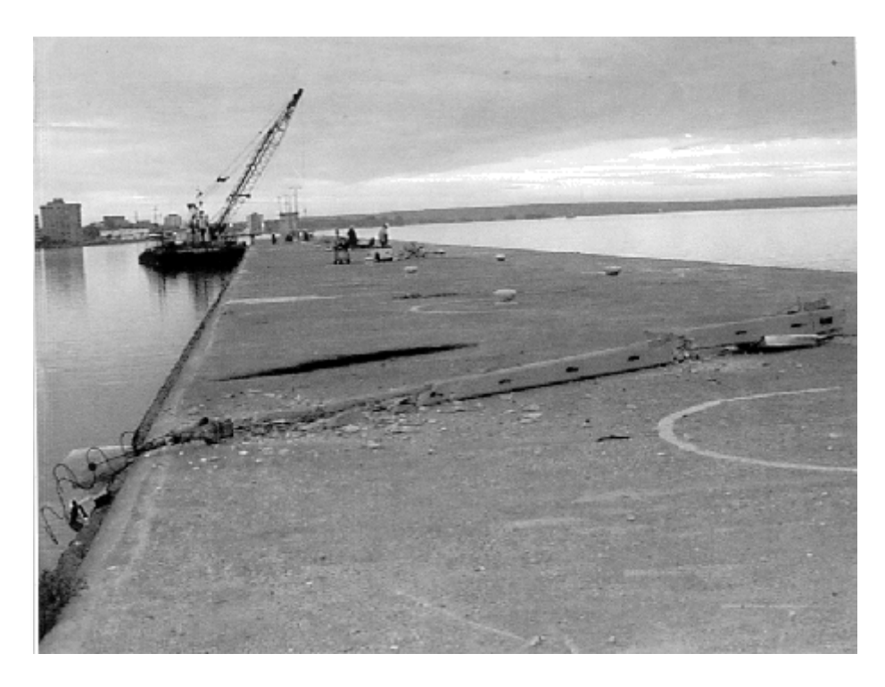
Damaged light standards on dock