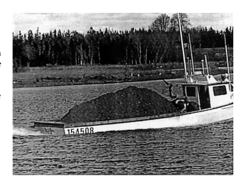
The "WET N' WILD II" with a typical load. 30 November 1999

Although not required for operating this vessel, the owner/operator had a valid Fishing Master, Class IV, certificate of competency issued in 1996. He also had held a certificate of competency as a Master, Small Craft which had expired in 1997. He had 17 years' experience in the fishing industry, most of it in the lobster fishery, during which time he had owned two other vessels of a type similar to the "WET N' WILD II". When engaged in lobster fishing, he usually had a crew of one. At the time of the occurrence, the vessel was engaged in transporting oyster shells in bulk. The curriculum for the fishing vessel master certification does not include