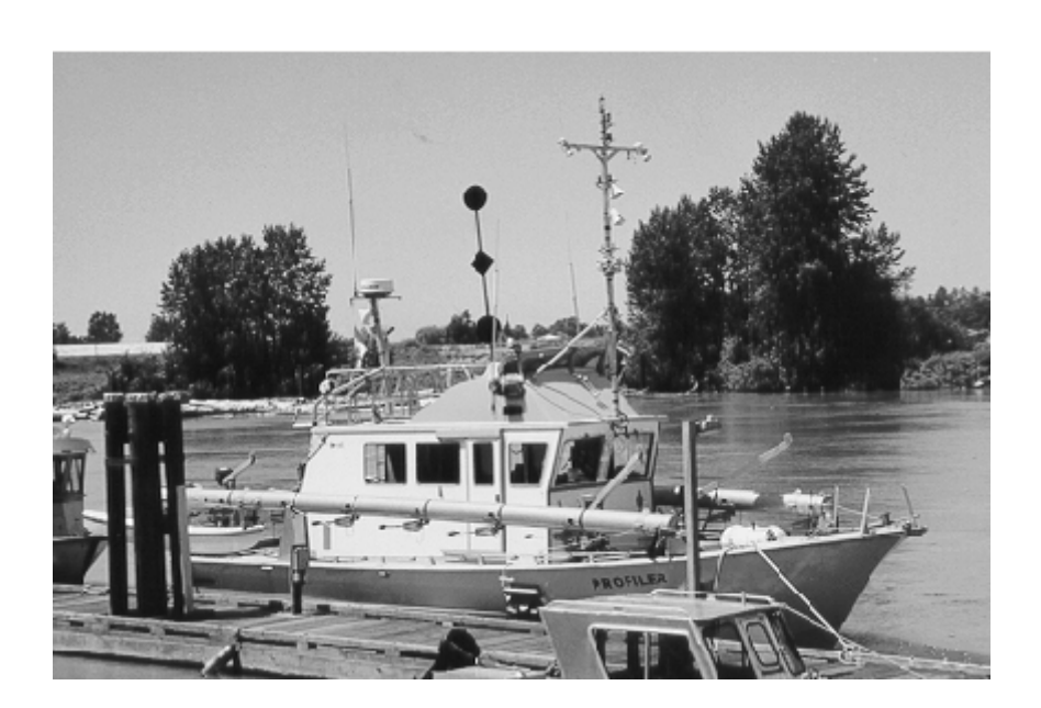
The "PROFILER" is one of the specially equipped boats used by PWGSC to conduct depth surveys on the Fraser River.