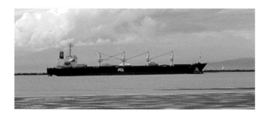
The "ALAM SELAMAT" anchored off Steveston jetty (in the background) after the grounding. Two tugs are assisting the vessel.