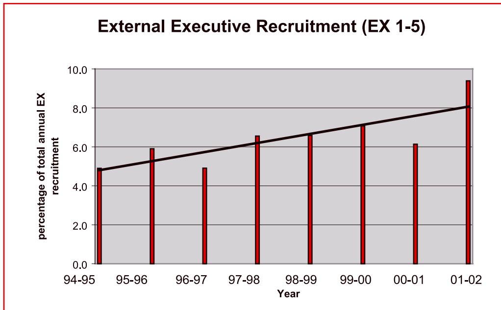
Table 1: Annual External Executive Recruitment into the Federal Public Service, 1994-2002

Source: Public Service Commission statistics. These numbers include Indeterminate and Term employees but exclude employees of the Canada Customs and Revenue Agency and Governor-in-Council appointments as well as Deputy Minister and Associate appointments. The line represents a trend line from 1994 to 2002.