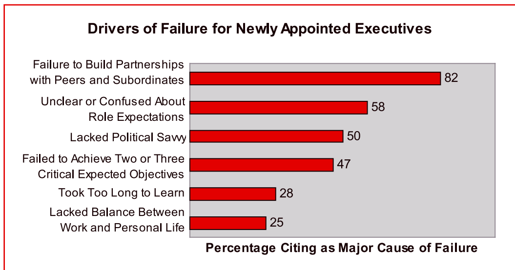
Table 3 – Reasons for Executive Failure in the Private Sector

Note: Total greater than 100 percent due to multiple responses. Source: Corporate Leadership Council, “Duty Free Onboarding,” Forced Outside (1997).