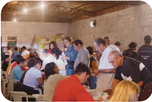
Porto Alegre citizens registering for a participatory budgeting meeting.