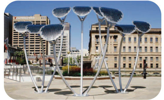
Solar Mallee Trees, Adelaide, South Australia.

A smart solution for municipal waste is using gas from decomposing garbage to generate electricity and reduce greenhouse gas emissions. Household waste can be incinerated in an environmentally-responsible manner, making garbage a valuable energy resource and extending the lifespan of landfills. Biogas for energy and fuel can be produced from waste (food, household, agriculture, and sewage sludge). As shown in Rayong, Thailand, the energy can serve households and industry, thus replacing the energy produced by power plants using fossil fuels. In San Salvador, El Salvador, a similar project has helped avoid landfill emissions and in turn the carbon reductions created trading certificates that can be sold under the Clean Development Mechanism.