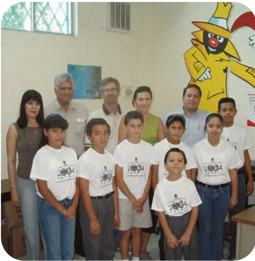
Water detectives and staff in Matamoros.