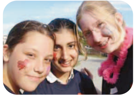
The GetOut! Youth Action Team at Tupper School in Vancouver.

GetOut! is a youth-led development initiative funded by Vancouver City Council to engage youth in active lifestyles. GetOut! aims to enhance the health, well-being and resilience of youth through actively engaging them in the arts, sport, culture, recreation and community. GetOut! Grants provide “Grants to Youth” and “Community Partnership Grants”. At its core, GetOut! is a participatory and holistic approach to youth health, well-being and resilience. It is both a youth-led finance program offering grants and a recreation program connecting youth to one another and their community.