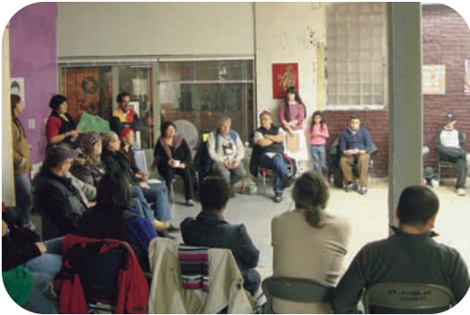
Native Youth Movement in Cauca, Colombia at Regional Assembly.