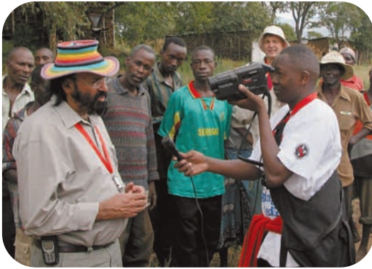
Operation Firimbi activists collecting information on rural land grabbing.