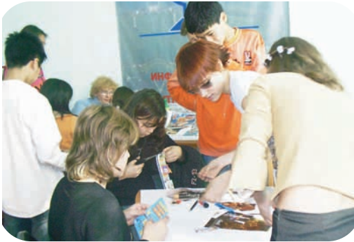
Global Youth Coalition training session, Kazakhstan.