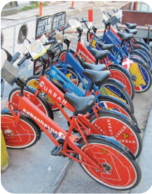
Free bicycles for use in Copenhagen.