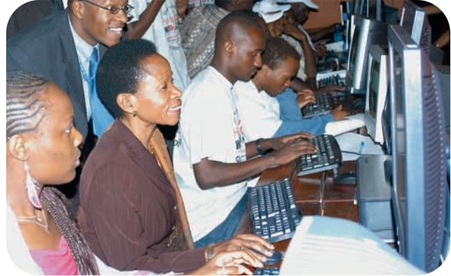
UN-HABITAT Executive Director, Anna Tibajuka, participating in the JAM.

The World Urban Forum (WUF) was conceived as a place where the energy and ideas from civil society and the private sector could be brought together in a dialogue with local, regional and national governments to provide advice to the United Nations – in particular to the Executive Director of UN-HABITAT, who leads the international program charged with responsibility for issues related to human settlements.