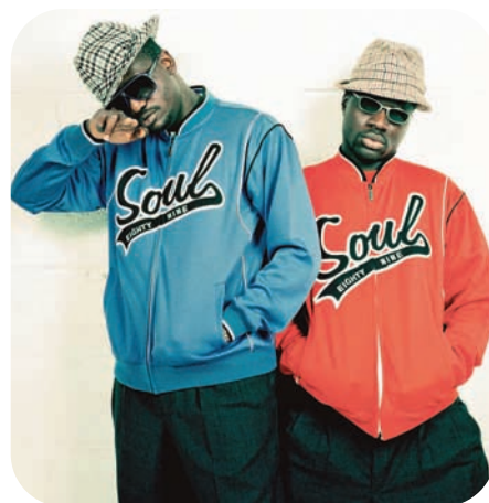
Gidi Gidi Maji Maji, UN Messengers of Truth.

Many children and youth grow up in situations where conflict is a part of daily living. In very different cultural settings, YOUCAN in Canada and Global Peace Hut Uganda, are training them in skills to confidently and courageously cope with violence, bullying, crime and gangs. YOUCAN is a leading Canadian organization "for youth, by youth". It provides training in conflict resolution and facilitation skills to strengthen young people personally and increase their capacity to reach out and help others. Global Peace Hut – Uganda's team of young trainers tap into traditional African wisdom around peacemaking and teach the ways of being a peacemaker in local language through folk stories, storytelling, puppetry, drama, games, art and music, as well as circle sharing.