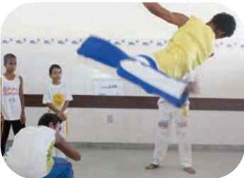
Capoeira used as a tool to engage youth during Brazil WUCs.

At the big picture level, the ideas that emerged had to do with building new coalitions of diverse stakeholders and using open source technology to increase the access of people to shared knowledge about urban sustainability (Ideas 2.1, 2.2). Opening up city government to more direct citizen involvement caught