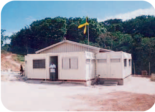
The Mandeville School in Jamaica, made from four shipping containers.