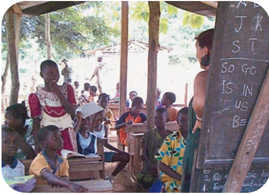
Youth Peace Brigades, Ghana.