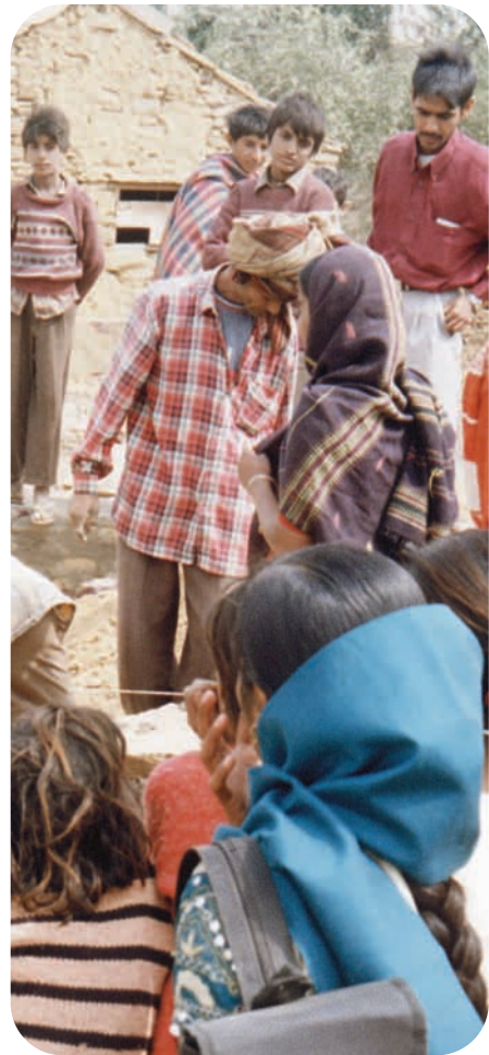
Women from India and Turkey monitor construction of earthquake-resistant housing.

GROOTS International and the Disaster Campaign of the Huairou Commission have developed Disaster Watches as a way of applying the learning and experience of women who have survived previous disasters to the monitoring of responses in new disasters and building relationships with local grassroots women's organizations. The method has also been applied to communities suffering from AIDS. Watches support women in disaster sites to assess their situation and voice their priorities and to ensure that recovery and reconstruction programs incorporate their views.