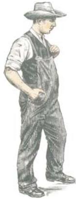
Farmer in summer

Help! Using a pencil or crayon, connect the farmer in winter, the farmer in summer, and the logger to the catalogue objects they need. Each person needs two objects.