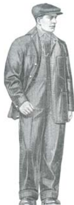
Farmer in winter