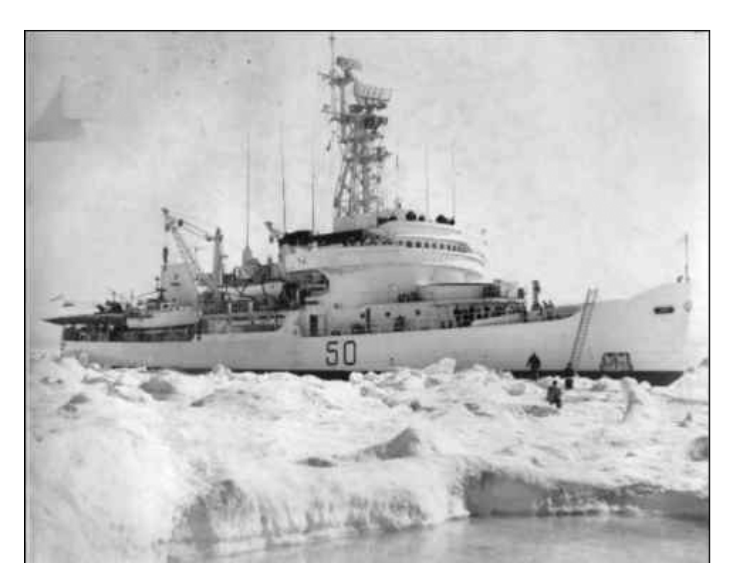
HMCS LABRADOR Locked in an Ice Pack

From 25 June to 3 July HMCS LABRADOR and her helicopters operated near Coral Harbour, on Southampton Island, where Foundation Company of Montreal, the prime contractor for the eastern sector of the DEW Line, had established a temporary-staging base. The eastern sector stretched from the middle of Boothia Peninsula (Shepherd Bay), in the west, to Cape Dyer on the East Coast of Baffin Island, topographically a nightmare of precipitous mountains and rocky gorges. HUP 247 was used for ice recce, transporting personnel and carrying navigation beacons ashore for assembly. Activities then moved north into Foxe Basin, for the remainder of July and the first week of August. Foxe Basin was a hazardous area to work in. It was a body of water where hydrographic data was scanty and the waters only crudely charted. This was aggravated by "rafting" and "hummocking" and carry-over old ice from one year to the next made this area of very rough ice.