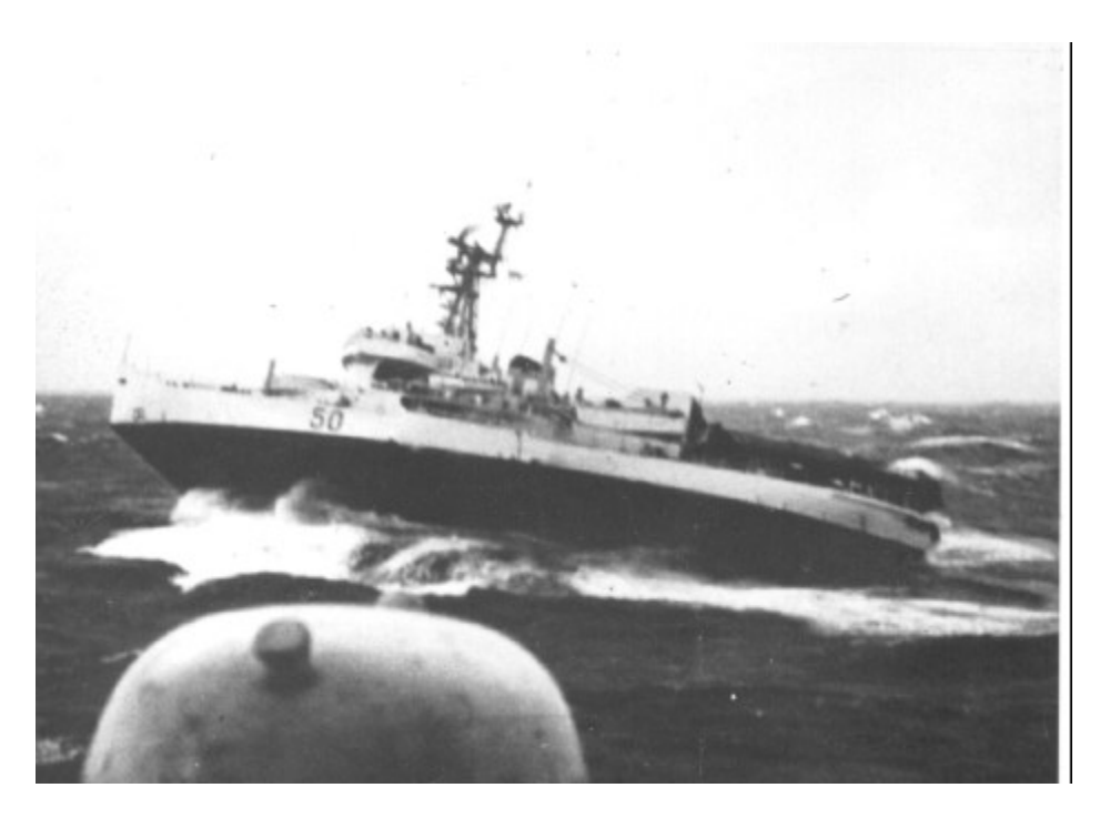
HMCS LABRADOR in Rough Seas Off Bermuda

The ship arrived in Montego Bay, Jamaica on 15 January. HUP 247 was then flown ashore to the Montego Bay Airport to establish radio communications between the ship and the airfield. Each morning HUP 247 was flown ashore to the Montego Bay Airport to keep it from being covered with a white mist being blown around from the paint rollers being used aboard ship. While in Montego Bay the Airport Manager requested that HUP 247 be made available to support their off-field SAR organization as they only had one small outboard motor boat in the lagoon alongside the main runway and nothing for use in the open ocean. This was accommodated as a good will gesture.