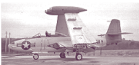
U.S. Navy McDonnell F2H-2 Banshee

When the Korean War began, the U.S. Navy had no swept-wing jet fighter in service. Its most modern aircraft were the McDonnell F2H Banshee and the Grumman F9F Panther. The Panther, arguably the best single-seat naval fighter in the world at the time, was also the very first to fire its guns in anger, in Korea, in July 1950. A tough and reliable performer, the F9F was first powered by a Pratt & Whitney J42 engine, a licence-built version of the Rolls-Royce Nene turbojet. Later aircraft had the J48 engine, an Americanized Rolls-Royce Tay. Although as powerful, the American aircraft had straight wings and was no match for the MiG-15. Neither was the twin-engine F2H, a docile and surprisingly adaptable machine given McDonnell Aircraft's youth and lack of production experience. As a result, the F9F and F2H fought in Korea mainly as fighter-bombers.