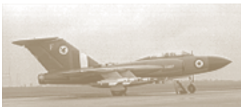
Royal Air Force Gloster Javelin F.(AW) Mk.8 (NAM)

Another weapon, far more destructive than any of its contemporaries, should be included in this tally even though it was not really a missile. The Douglas MB-1 Genie was a massive looking unguided rocket fitted with a nuclear warhead. This anti-bomber weapon entered service around 1958. It was detonated by a radio signal emitted by the fire-control system of the carrier plane and its warhead could destroy any aircraft within a radius of more than 300 metres. Given the questionable reliability of most air-to-air missiles of the time and the deadly cargo carried by Soviet jet bombers, the basic concept behind the MB-1 made a great deal of sense, at least as far as the USAF was concerned. Its 1.5 kiloton warhead was later fitted to the Hughes GAR-11 Nuclear Falcon, a still larger version of the original GAR-1 Falcon missile. Unlike the MB-1, the GAR-11 was fitted with a guidance system – in this case a semi active radar seeker.