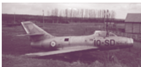
Armée de l'Air Dassault Mystère IIC (NAM)

The French followed a very different route. Rebuilding the country and the armed forces was a matter of national pride after the humiliating defeat of 1940. France's chosen instrument was a company founded by an aircraft designer who had spent most of the Second World War in a concentration camp. Born Marcel Bloch, he changed his name to Marcel Dassault. His first jet fighter was a simple and well-designed machine with just a hint of a sweep in its wing and tail. The Dassault MD.450 Ouragan was powered by a Rolls-Royce Nene built under licence by a famous French aircraft engine maker, Hispano-Suiza. Unspectacular but easy to maintain, the MD.450 Ouragan went into service in early 1952.