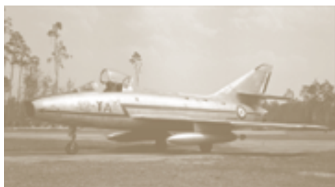
Armée de l'Air Dassault Super Mystère B2 (NAM)

With the success of these fighters, the French company produced the Dassault Super Mystère B2, western Europe's first supersonic aircraft. Sporting an air intake similar to that of the F-86 Sabre, and other less visible borrowings from the F-100 Super Sabre, the new machine was powered by a SNECMA Atar 101 fitted with an afterburner. Entering service in 1957, the Super Mystère B2 enjoyed a long and successful career. It was the final development of Dassault's widely used series of swept-wing daytime fighters.