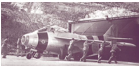
Swedish air force SAAB J 29C (NAM)

Surprisingly, the first swept-wing fighter to be produced in Western Europe was not British, or even French. That honour belonged to neutral Sweden and its SAAB J 29, delivery of which had begun in May 1951. Widely known as the "Tunnan" because of its barrel shape, the J 29 was based on German wartime ideas of what a jet fighter could look like. It carried four 20-mm cannons and was powered by a de Havilland Ghost produced under licence in Sweden. The portly J 29 was a surprisingly agile airplane with a high rate of climb. Later versions were fitted with an afterburner developed by Swedish engineers. It was with this fighter that SAAB took its place as one of the main fighter aircraft manufacturing companies in the Western world.