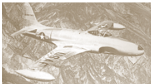
U.S. Air Force Lockheed F-80 Shooting Star

Some fighter units were more fortunate and flew the first generation of straight-wing jet fighters developed near the end of the Second World War and after. Great Britain had the Gloster Meteor and de Havilland Vampire, the first jet fighter to serve with the Royal Canadian Air Force (RCAF). Early versions of the Meteor had been used operationally during the war, but had never faced their German counterpart, the Messerschmitt Me 262 Schwalbe, or the rocket-powered Messerschmitt Me 163 Komet. In the early postwar period, the United States could count on the Lockheed F-80 Shooting Star and Republic F-84 Thunderjet. The USSR had the Mikoyan-Gurevich MiG-9 and the Yakovlev Yak-15 and Yak-17, which were loosely based on the well known piston-powered Yakovlev Yak-3 from the Second World War. A conversion similar to the one performed by the Soviet engineers took place later on in Sweden, resulting in the SAAB J 21R, the first jet fighter designed by a middle-ranked power to go into service.