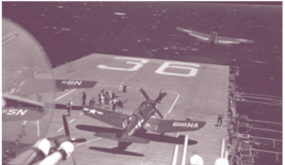
A U.S. Navy Vought F4U-5 Corsair on the flight deck of an aircraft carrier (U.S. Navy)