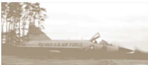
U.S. Air Force Convair F-102A Delta Dagger (NAM)

Other missile pioneers of the 1950s included France's SNCAN Nord 5103 beam-riding missile as well as the Matra R.511 semi-active radar-homing missile. The Mystère IV, the Super Mystère B2 and the S.O. 4050 Vautour IIN could all be equipped with Nord 5103s. In Great Britain, de Havilland Propellers was the main player in this new field. Its first successful product, the Firestreak, was an interesting weapon. In spite of its complexity, the Firestreak was said to be both more reliable and deadlier than the far better known GAR-8/AAM-N-7 Sidewinder. It entered service in 1958 and was fitted to aircraft like the Royal Navy's Sea Vixen and the RAF's Javelin. Both could carry four missiles.