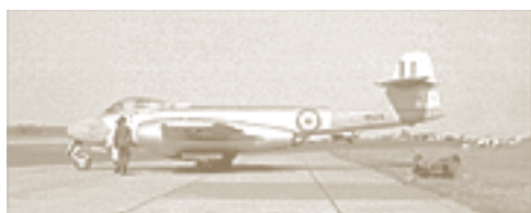
Royal Air Force Gloster Meteor F. Mk.8 (NAM)

A limited number of specialized night fighters were also in use. These were mostly twin engine, two-seaters fitted with rather unreliable, short-range radar sets. A well-known wartime design like the de Havilland Mosquito (U.K.) and the brand new North American F-82 Twin Mustang (U.S.A.) were typical of this class of aircraft. Carrier-based night fighters were versions of single-engine, single-seaters like the F8F Bearcat and F4U Corsair (U.S.A.), or of twin-engine, two-seat aircraft like the F7F Tigercat (U.S.A.) and the de Havilland Sea Hornet (U.K.).