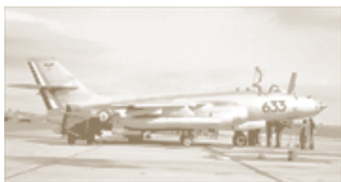
Armée de l'Air SNCASO S.O.4050 Vautour II B (NAM)

To keep up with their intended targets, all-weather fighters eventually had to leave these straight wings behind. One of these aircraft was the Yakovlev Yak-25, the first machine of this type to be produced for the Soviet military. Fitted with a bicycle-type undercarriage comparable to that of the Boeing B-47 Stratojet medium range bomber, this solid machine may have been the first swept-wing all-weather fighter to go into service, in 1955. In Great Britain, engineers developed the Gloster Javelin, the world's first twin-engine two-seat, delta wing aircraft and one of the most distinctive fighters of the 1950s. The design of its triangular wing was based on German research seized after the Second World War. With its large area and internal volume, this huge wing provided plenty of space for the landing gear, as well as fuel and weaponry. The first production aircraft were issued to a squadron in February 1956. Although pleasant to fly, the Javelin was slow and the multitude of versions did not facilitate the work of maintenance crews.