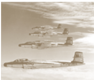
A formation of Royal Canadian Air Force Avro Canada CF-100 Mk.4Bs (NAM)

It was in 1951 that the RAF received its first jet-powered night fighters. As had been the case with the F-89 Scorpion, the type designed specifically for the air force was not the first to go into service. Known as the Armstrong Whitworth Meteor, this aircraft was a two-seat development of the airplane originally designed by Gloster. The other machine, also based on a single-seat fighter, was developed as a private venture for the export market. Twelve of these de Havilland Vampire night fighters were ordered by the Egyptian air force, but were taken over by the British government when it imposed an embargo on the export of arms to Egypt. Additional aircraft were built for the RAF as a stopgap measure pending the delivery of better machines. Neither of these night fighters ever fired their weapons in anger.