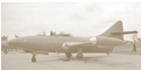
U.S. Navy Grumman F9F-2 Panther (NAM)