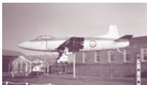
A Supermarine Attacker F. Mk.1 on display on a Royal Navy base (NAM)

These aircraft were far superior to anything the British Fleet Air Arm was flying. The very popular and supremely elegant Hawker Sea Hawk still had a straight wing. Because of this, it could not match the performance of contemporary swept-wing fighters. A product of Sydney Camm's prolific pen, the Sea Hawk went into service in March 1953. A year later, a number of navy crews started to convert to the de Havilland Sea Venom, the Royal Navy's first jet-powered all-weather fighter. As the name implied, it was a navalized version of the de Havilland Venom, a twin-boom design similar in appearance to the earlier Vampire. Little good can be said of the older and slower Supermarine Attacker, which had gone into service in August 1951, other than that it was the first jet fighter designed to operate from British aircraft carriers. It and the Soviet Yak-15 were the only production jet aircraft to be fitted with a tail wheel.