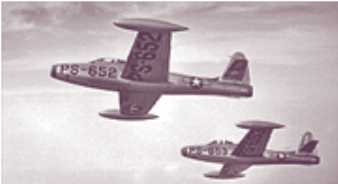
Two U.S. Air Force Republic F-84B Thunderjets