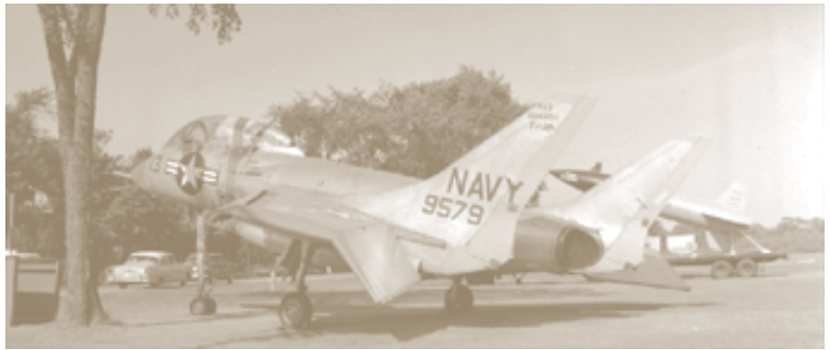
U.S. Navy Vought F7U-3 Cutlass (NAM)