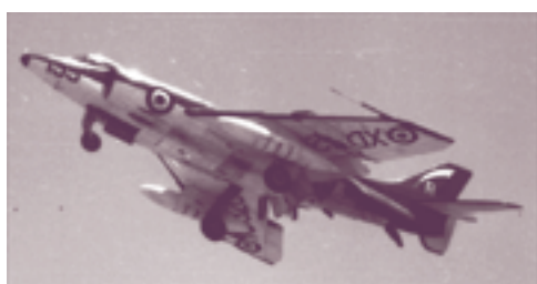
Royal Navy Supermarine Scimitar F. Mk.1

The U.S. Navy's second supersonic gunfighter was the more formidable Vought F8U Crusader. Powered by a Pratt & Whitney J57, which produced fifty percent more thrust than the F11F's Wright J65, the new fighter was a highly innovative design. Its most radical feature was its wing, mounted on pivots in such a way that its leading edge could be raised for takeoff and landing. Even though lift was increased to some degree, the F8U remained a difficult aircraft to land. In the air, however, pilots had nothing but praise for it. Few land-based fighters could win a dogfight against the F8U. Regard for this airplane was such that most of them were rebuilt to prolong their life, even into the 1980s. Both the F11F and the F8U carried four 20-mm Pontiac M39 cannons.