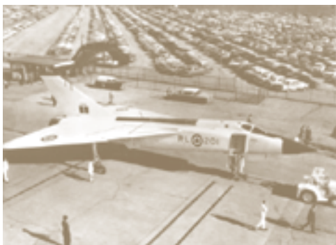
The first Avro CF-105 Arrow Mk. 1 (NAM)

The F-106 Delta Dart was not the only all-weather fighter under development in 1957–1958 for the USAF. It had already flown, however, and delivery was expected to begin fairly quickly. Its more advanced successors were not so lucky. The Republic F-103, for example, was undoubtedly the most exotic-looking fighter plane of the 1950s. This huge airplane built of heat-resistant titanium and stainless steel was designed to reach Mach 4, an incredible 70 kilometres per minute, at very high altitude. However, it was cancelled in August 1957, before construction of a prototype had actually started. The North American F-108 Rapier suffered a similar fate in September 1959. This Mach 3 aircraft was both larger and heavier than any other fighter plane of that era. It incorporated many ideas developed for an equally fast and advanced aircraft, the North American B-70 Valkyrie long-range bomber, which also fell victim to the changing times. Changing requirements played as great a role in the cancellation, in December 1958, of the most spectacular carrier-based fighter of the 1950s. The Vought F8U-3 Crusader III had little in common with its predecessor. More powerful and armed only with missiles, it was a formidable dog-fighter. Unfortunately, it came into being as the U.S. Navy set out to obtain larger and more versatile fighter planes.