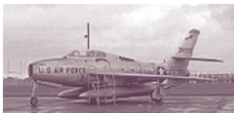
U.S. Air Force Republic F-84F Thunderstreak (NAM)

Other American companies also revamped their fighters. Republic Aviation, for example, produced a swept-wing derivative of its F-84 Thunderjet. Known as the Republic F-84F Thunderstreak, the new machine was powered by a Wright J65, a licensed version of yet another British jet engine, the superb Armstrong Siddeley Sapphire. Although easy to land, the F-84F approached at a very fast speed. Like its predecessor, it was somewhat underpowered and needed long runways to take off, especially during the summer. USAF service began in January 1954. A poor dogfighter, the F-84F was offered free of charge to numerous NATO air forces, where it served many years as a fighter-bomber.