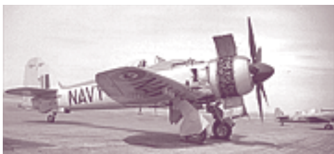
Royal Canadian Navy Hawker Sea Fury F.B. Mk. 11 (NAM)

As the 1940s drew to a close, most day fighter units worldwide were still flying single-engine piston-powered single-seat aircraft designed during, if not before, the Second World War. In fact, many of these fighters were still being produced after the war had ended, in places like the USSR, and in Great Britain and the United States, where they were primarily used in naval air units. They were the last of their kind and, as such, the ultimate expression of their designers' art. Among them were aircraft like the Lavochkin La-11 and Yakovlev Yak-9P (USSR); the Hawker Sea Fury and the Supermarine Spitfire and Seafire (U.K.); the Grumman F8F Bearcat, the Vought F4U Corsair, and the North American P-51/F-51 Mustang (U.S.A.). Powerful twin-engine fighters, like the de Havilland Hornet (U.K.) and the Grumman F7F Tigercat (U.S.A.), were flown in small numbers.