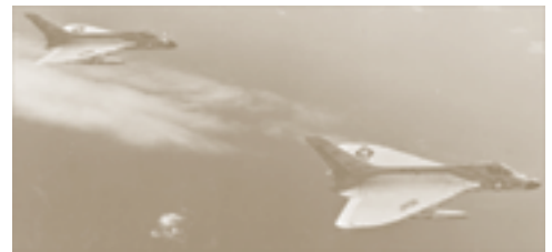
Two U.S. Navy Douglas F4D-1 Skyrays

A thoroughly unconventional airplane, the F7U Cutlass had a broad, swept wing to which were attached a pair of very large vertical tail surfaces. Development proved difficult but its potential was such that the U.S. Navy stuck with the project. The first fully developed version showed that it could outfight any naval fighter then in service. Losses to accidents were heavy, however, and pilots did not really like the F7U. The type entered service in mid-1954 and was retired a few years later. Designed by Ed Heinemann, one of the most gifted aeronautical engineers in history, the F4D Skyray was another highly innovative machine. A formidable dogfighter, this single-seat interceptor had a very high rate of climb. The F4D's all but triangular wing was based on research done during the Second World War in Germany by the creator of the Me 163 Komet rocket-powered interceptor. Its Pratt & Whitney J57 engine could power it to a speed just below Mach 1. The first squadron took delivery in the spring of 1956.