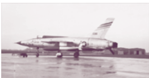
U.S. Air Force Republic F-105D Thunderchief (NAM)

Of limited value as an interceptor because of its limited electronics, the F-104 Starfighter would have been abandoned had Lockheed not re-engineered the aircraft as a fighter-bomber. The new F-104G "Super Starfighter" was a resounding export success. Germany was the launch customer. An initial batch of F-104Gs was declared operational in June 1962. Canadair produced almost four hundred CF-104s and F-104Gs for both the RCAF and NATO countries. A much heavier machine, the F-104G was flown fast at low level to provide its pilots with realistic training. It was very stable, responsive and safe when flown strictly by the book. The F-104G was one of the mainstays of NATO air forces throughout the 1960s and 1970s.