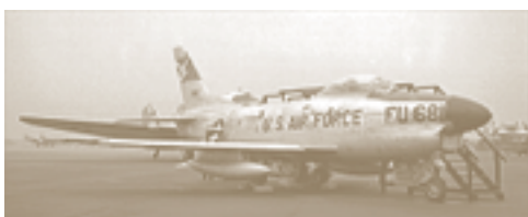
U.S. Air Force North American F-86D Sabre (NAM)

In the opposing camp, production of the F-86 Sabre continued. In the United States, a heavier and more powerful fighter-bomber version was developed. In other countries, companies like Commonwealth Aircraft in Australia and especially Canadair in Canada produced airplanes that could outfight their American-built counterparts in air-to-air combat. The Australian aircraft were fitted with a Rolls-Royce Avon engine. Later versions of the Canadair-built Sabres had the Avro Canada Orenda. Earlier versions of this aircraft were transferred to many Allied countries as well as members of NATO. Canadair-built Sabres, for example, became the first swept-wing fighters to be operated by the RAF.