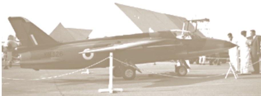
A Finnish air force Folland Gnat F. Mk.1 with temporary Royal Air Force markings (NAM)

Surprisingly, the first swept-wing fighter to be produced in Western Europe was not British, or even French. That honour belonged to neutral Sweden and its SAAB J 29, delivery of which had begun in May 1951. Widely known as the "Tunnan" because of its barrel shape, the J 29 was based on German wartime ideas of what a jet fighter could look like. It carried four 20-mm cannons and was powered by a de Havilland Ghost produced under licence in Sweden. The portly J 29 was a surprisingly agile airplane with a high rate of climb. Later versions were fitted with an afterburner developed by Swedish engineers. It was with this fighter that SAAB took its place as one of the main fighter aircraft manufacturing companies in the Western world.