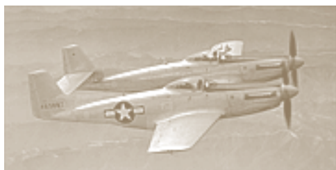
U.S. Air Force North American F-82B Twin Mustang

A limited number of specialized night fighters were also in use. These were mostly twin engine, two-seaters fitted with rather unreliable, short-range radar sets. A well-known wartime design like the de Havilland Mosquito (U.K.) and the brand new North American F-82 Twin Mustang (U.S.A.) were typical of this class of aircraft. Carrier-based night fighters were versions of single-engine, single-seaters like the F8F Bearcat and F4U Corsair (U.S.A.), or of twin-engine, two-seat aircraft like the F7F Tigercat (U.S.A.) and the de Havilland Sea Hornet (U.K.).