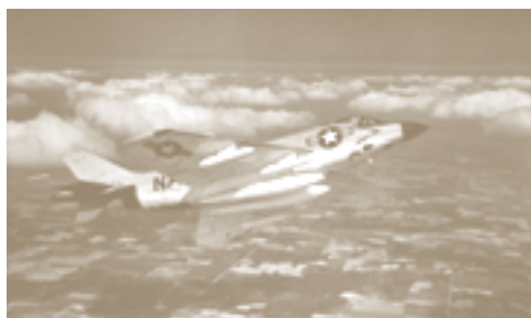
U.S. Navy McDonnell F3H-2N Demon (U.S. Navy)

All aircraft are critically dependent on the performance and quality of their engines. The failure of the F4D Skyray's original engine, the Westinghouse J40, had been an irritant to Douglas engineers. At McDonnell Aircraft, that same failure brought to a virtual standstill the production of the company's first swept-wing design, the F3H Demon. First delivered to a squadron in March 1956, the new airplane was still underpowered and proved disappointing. All three airplanes were fitted with four 20-mm cannons. In addition, the F7U Cutlass could carry a belly tray with thirty-two 69.9-mm "Mighty Mouse" rockets.