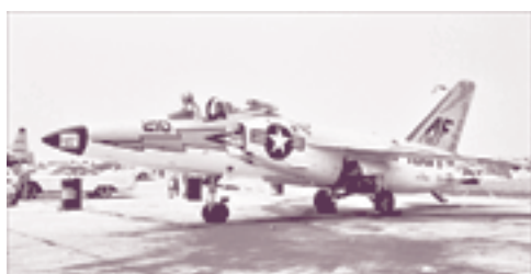
U.S. Navy Grumman F11F-1 Tiger (NAM)

The other light fighter design produced in the 1950s was built to meet NATO's first-ever operational requirement. Issued in 1954, this specification was for a rugged and easily maintained light attack fighter that could operate from short runways and prepared grass strips. The new machine was to become standard equipment in NATO air forces. The winning entry was the Fiat G.91, the first Italian-designed jet aircraft to be produced in quantity. It bore a marked resemblance to the F-86K Sabre, hardly surprising given that the American fighter had been built under licence by Fiat. Although heavier and larger than the Gnat, the Italian aircraft was also fitted with a Bristol Orpheus engine. Internal armament consisted of four 12.7-mm Colt-Browning machine guns or two 30-mm DEFA cannons. A delightfully agile aircraft, the G.91 was an early victim of NATO's perennial problem with weapon standardization. Every NATO member agreed with the basic idea. Those with an aircraft industry, however, wanted their own aircraft to be accepted by everybody else. As a result, the G.91 served with the air forces of only three of the fifteen NATO countries. Deliveries to an Italian squadron began in the spring of 1959.