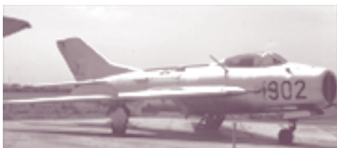
Indonesian air force Mikoyan-Gurevich MiG-19 (NAM)

A precedent-setting machine in every sense of the word, the American aircraft was the first of a new generation of fighter airplanes. One could argue that it was the F-100 that started the trend toward ever increasing development and production costs. New materials, techniques and tooling, as well as improved aerodynamics and greater engine power, proved very expensive, and only a few countries would be able to afford them. The F-100's design was so advanced that it actually overstepped the boundaries of aerodynamic knowledge. The loss of several aircraft early on, in unusual circumstances, led to an in-depth study that recommended the wingspan and the vertical tail surface area be increased; this research has influenced the design of most supersonic aircraft ever since. Sadly, the superb F-100 was the last fighter produced in quantity by North American.