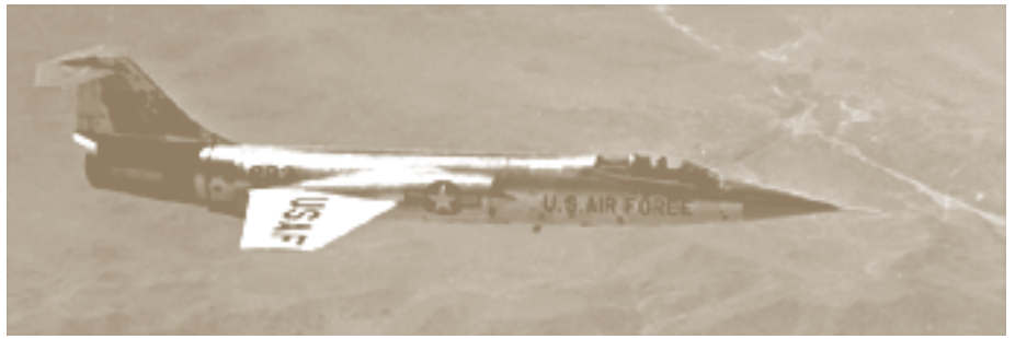
U.S. Air Force Lockheed F-104C Starfighter

Toward the end of the decade, a new breed of fighter plane appeared on the world scene, introducing a whole new level of performance. They were the so-called Mach 2 fighters. The first off the mark was the Lockheed F-104 Starfighter, one of the most radical and spectacular fighter planes ever developed. It was created by Kelly Johnson in response to complaints by Korean War pilots that the aircraft they used in combat could not climb fast enough or high enough and were too slow. Lockheed's answer was a pure interceptor with minimal electronics and tremendous acceleration, speed and rate of climb. From the beginning, however, it was an airplane that was not easy to fly. The F-104 was the first production aircraft to be powered by one of the most widely used jet engines in history, the highly-reliable General Electric J79 turbojet. A squadron received its first machine in January 1958.