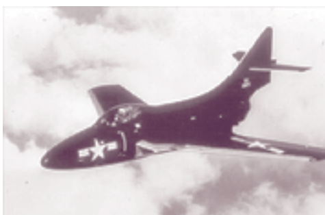
U.S. Navy Grumman F9F-6 Cougar

The Grumman F9F Cougar resulted from a similar conversion. This swept wing version of the F9F Panther was developed in record time. A squadron received its first aircraft in November 1952, only fourteen months after the initial flight of the prototype. Although lacking in elegance, the new fighter proved popular with its pilots. Even if the U.S. Navy was quite happy to use relatively low-risk conversions like the swept-wing FJ Fury and the F9F Cougar, it could still be as daring as the USAF. Indeed, naval pilots flew what were arguably two of the most spectacular and radical fighters of the 1950s, the Vought F7U Cutlass and the Douglas F4D Skyray.