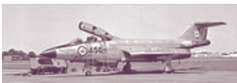
Royal Canadian Air Force McDonnell CF-101B Voodoo (NAM)

Standard armament consisted of six Falcon missiles of various types mounted on swinging arms, each in its individual compartment. Immediately before a missile was to be fired, the doors of its compartment were opened and the arms swung down, moving the missile away from the fuselage. The missile was released, the arms came up and the doors shut tight. The entire process lasted two seconds. Like all other delta wings, that of the F-102 Delta Dagger was based on German technical data seized after the Second World War. A large and somewhat inelegant fighter, it proved surprisingly manoeuvrable and easy to fly in operation. Pilot workload was high but they still liked the airplane and its Pratt & Whitney J57 engine.