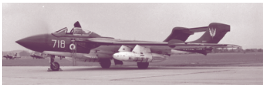
Royal Navy de Havilland Sea Vixen F.A.W. Mk.1 (NAM)

By comparison, the Royal Navy had to make do with the Supermarine Scimitar and the de Havilland Sea Vixen, two thoroughly subsonic designs. The Scimitar was introduced in June 1958. Powerful, tough and popular with its pilots, the Scimitar was the first swept-wing aircraft to serve on a British aircraft carrier and, sadly, the last product of the Supermarine design team. It was armed with four 30-mm ADEN cannons. The Sea Vixen, a swept-wing all-weather fighter, was put in service in July 1959 to complement this day fighter and attack aircraft. Originally developed for a competition won by the Gloster Javelin, the Sea Vixen was the ultimate development of the twin-boom design inaugurated by the Vampire. Fitted with two Rolls-Royce Avon engines comparable to those of the Scimitar, this large two-seater was built without any guns, a first for a British fighter. Instead, its internal armament consisted of two retractable boxes or trays below the fuselage that housed a total of twenty-eight 50.8-mm unguided folding-fin rockets, too small a number to be fully effective. It could also carry far deadlier air-to-air missiles.