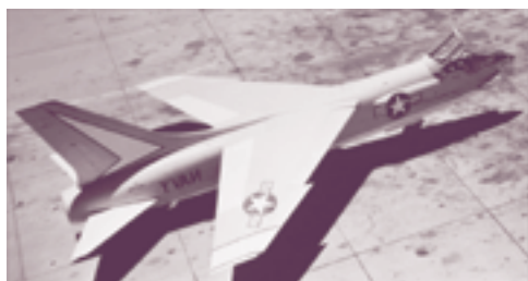
A U.S. Navy Vought F8U-1 Crusader

The U.S. Navy's second supersonic gunfighter was the more formidable Vought F8U Crusader. Powered by a Pratt & Whitney J57, which produced fifty percent more thrust than the F11F's Wright J65, the new fighter was a highly innovative design. Its most radical feature was its wing, mounted on pivots in such a way that its leading edge could be raised for takeoff and landing. Even though lift was increased to some degree, the F8U remained a difficult aircraft to land. In the air, however, pilots had nothing but praise for it. Few land-based fighters could win a dogfight against the F8U. Regard for this airplane was such that most of them were rebuilt to prolong their life, even into the 1980s. Both the F11F and the F8U carried four 20-mm Pontiac M39 cannons.