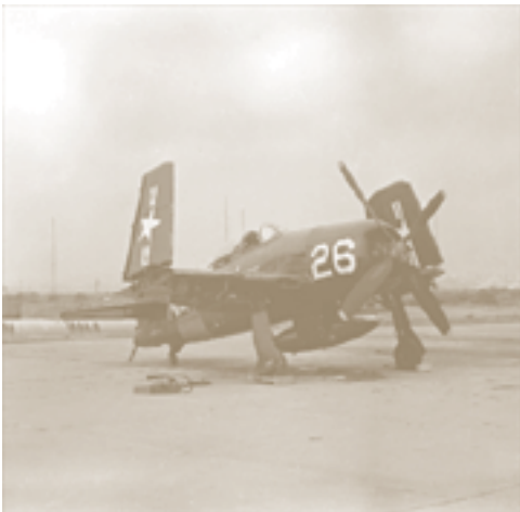
U.S. Navy Grumman F8F-2 Bearcat (NAM)