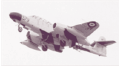
Royal Air Force Armstrong Whitworth Meteor N.F. Mk.11 (NAM)

It was in 1951 that the RAF received its first jet-powered night fighters. As had been the case with the F-89 Scorpion, the type designed specifically for the air force was not the first to go into service. Known as the Armstrong Whitworth Meteor, this aircraft was a two-seat development of the airplane originally designed by Gloster. The other machine, also based on a single-seat fighter, was developed as a private venture for the export market. Twelve of these de Havilland Vampire night fighters were ordered by the Egyptian air force, but were taken over by the British government when it imposed an embargo on the export of arms to Egypt. Additional aircraft were built for the RAF as a stopgap measure pending the delivery of better machines. Neither of these night fighters ever fired their weapons in anger.