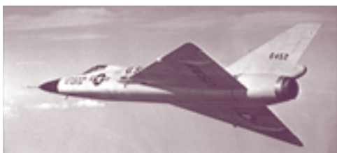
U.S. Air Force Convair F-106A Delta Dart

It was in May 1958 that a USAF squadron took delivery of its first Republic F-105 Thunderchief. Although designated as a fighter, it had not been designed for air combat. Immensely popular with its pilots because of its toughness, the F-105 was supremely fast at low level. It could carry bomb loads equivalent, if not superior, to those of a Second World War heavy bomber. A few bombs could be carried internally, and it also had an M61 Vulcan cannon. The F-105 was originally developed as a private venture, and was fitted with the powerful and highly successful Pratt & Whitney J75 turbojet, civilian models of which flew in long-range versions of the Boeing 707 and Douglas DC-8 airliners. This formidable fighter bomber, the heaviest single-seat aircraft of its era, was rightly nicknamed the "one man air force." It served with great distinction during the Vietnam War.