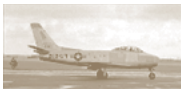
U.S. Air Force North American F-86A Sabre (NAM)

The F-86 Sabre, first flown in combat in December 1950, was not as easily dismissed as these straight-wing aircraft. Designed to counter jet-powered fighters and fighter-bombers operating by day, it would have been fitted with straight wings had the results of wartime German research on swept wings not become available early in its development. As a result of this new information, the F-86 was redesigned with swept wings in order to maximize performance. In the latter half of the 1940s, the F-86 and the MiG-15 were considered cutting-edge engineering. Although somewhat more powerful and reliable than the MiG-15, the F-86 was approximately one third heavier. It could not turn as well, climb as fast or fly as high as its Soviet rival. Above 6000 metres the F-86 became increasingly slower. However, it was more stable and easier to handle at high speed and was a better gun platform. In fact, armament was the single greatest difference between the two aircraft.