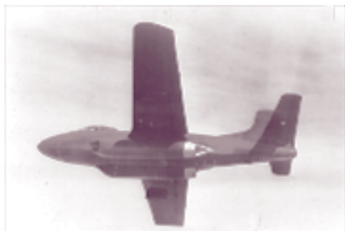
U.S. Navy Douglas F3D-1 Skyknight (NAM)

To be credible and effective, defensive fighters had to be present in sufficient numbers and able to intercept incoming bombers regardless of the weather or time of day. Aircraft capable of doing this had been known as night fighters, but increasingly they would be referred to as all-weather fighters, even though they were quite incapable of fighting in all kinds of weather. This change in terminology was yet another example of the optimism and faith in technology one encounters so frequently throughout the history of military aviation. Even so, the change was significant because it was in the 1950s that air forces acknowledged that the word "fighter" had become a catch-all term that meant anything anyone wanted it to mean; there was no longer such a thing as "a fighter." While it is true that during both the First and Second World Wars many fighters carried small bombs and, in some cases, big ones, this was primarily the result of war-driven modifications to aircraft already in service. As well, early night fighters tended to be versions of aircraft designed for other purposes. The 1950s changed all that. Larger air forces required, and engineers developed, a multitude of aircraft, each designed to perform a specific task within increasingly integrated national defence structures.