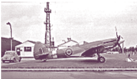
A Supermarine Spitfire F. Mk. 22 on display on a Royal Air Force base (NAM)