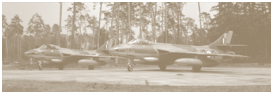
Two Royal Air Force Hawker Hunter F. Mk.6s (NAM)

The RAF was somewhat better off, but its first home-grown swept-wing fighters, the Hawker Hunter and the Supermarine Swift, entered service only in July and August 1954 respectively. The Hunter was by far the better of the two. Another aircraft designed by Sydney Camm, the Hunter was elegant, manoeuvrable and all but unbreakable. This, along with the airplane's four 30-mm ADEN cannons, led to its wide-scale use as a fighter-bomber. A typical British design, it had only a limited range. The Armstrong Siddeley Sapphire powered early versions of the aircraft. Most Hunters, however, had the Rolls-Royce Avon, an engine also used on airliners like the de Havilland Comet and the SNCASE S.E.210 Caravelle, one of the most elegant designs of the age. Both powerplants clearly illustrated the high level of performance achieved by British aircraft engine designers. Widely exported and used for decades after its first flight, the Hunter was undoubtedly one of the greatest fighters of all time.