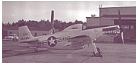
Air National Guard North American P-51H Mustang (NAM)