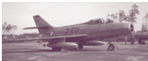
Armée de l'Air Dassault Mystère IVA (NAM)

The introduction of this aircraft signalled the beginning of the company's conscious policy to take only manageable steps in its quest for progress; there would be no great leaps into the unknown. A swept-wing development of its predecessor, the Dassault Mystère IIC was ordered to keep the production line humming while the much better Mystère IVA was being introduced. Although similar on the outside, the new machine was entirely new under the skin. The SNECMA Atar 101 of the Mystère IIC was replaced by a Rolls-Royce Tay built in France by Hispano-Suiza and, later, by the French-derived Verdon. British and American assistance were also of great help in areas like tooling and accessories. The Mystère IIC and the Mystère IVA were developed concurrently and entered service in 1954. In both cases, the four 20-mm Hispano-Suiza cannons of the MD.450 Ouragan were replaced by two of the greatly superior 30-mm DEFAs.