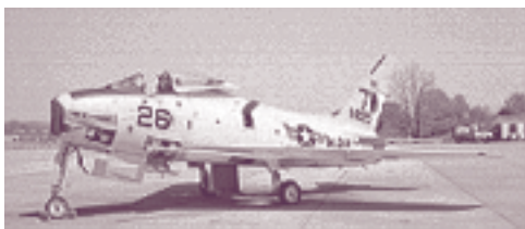
U.S. Navy North American FJ-4B Fury (NAM)

Remarkably enough, North American was able to use the F-86 as a starting point for a series of carrier-based fighters and fighter-bombers for the U.S. Navy. Even though they all bore the same name, the North American FJ-2 Fury had little in common with the FJ-3 or the greatly improved FJ-4. An initial batch of FJ-2s was delivered to a squadron in early 1954. Navy pilots received their first FJ-4s a year later.