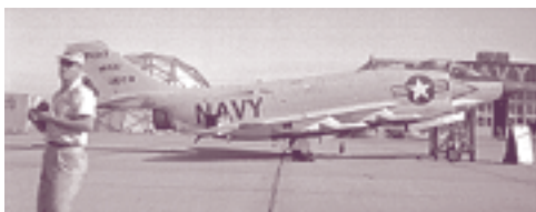
U.S. Navy McDonnell F3H-2M Demon

Nineteen fifty six was a particularly auspicious year for missile development. It was in July of that year that the U.S. Navy introduced another trend-setting weapon, the Sperry AAM-N-2 Sparrow I. Considerably larger than the GAR-1 Falcon, this weapon was known as a beam rider because it flew within the radar beam its carrier plane directed at the intended target. To ensure success, the fighter had to keep its radar equipment locked on the enemy aircraft until impact. The missile's size was a result of the rather poor accuracy of its guidance system – a large airframe was needed to carry the heavy warhead deemed necessary to ensure destruction of a target. Specialized all-weather versions of carrier-based fighters like the F3D Skyknight and the F7U Cutlass flew with AAM-N-2s but never fired any in combat. Another development, the Raytheon AAM-N-6 Sparrow III, was a semi-active radar homing missile introduced in 1958. Specifically designed for use against targets that were too far to be seen by the naked eye, it was the most expensive air-to-air missile of its time. The AAM-N-6 Sparrow III proved superior to its predecessor. The F3H Demon was the first airplane fitted with this weapon. All three carrier-based fighters carried up to four Sparrow missiles each. Greatly improved versions of the Sparrow III medium range missile were still being produced almost four decades after the initial delivery.