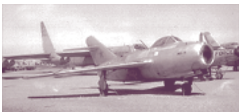
A captured North Korean air force Mikoyan-Gurevich MiG-15 (NAM)

As the 1950s began, the Cold War intensified. On 25 June 1950, North Korea launched a surprise attack on South Korea. Overwhelmed by their enemy's superior firepower, the South Koreans retreated. On 27 June, the United Nations' Security Council approved a resolution asking member nations to help the South Koreans repel their opponents. Within a week, United States Air Force (USAF) units based in Japan gained control of the sky and started to attack the North Korean army. Starting from a small pocket around the southern coastal city of Pusan, United Nations airmen and soldiers moved north all the way to the Chinese border. Faced with the collapse of its neighbouring ally, China entered the conflict late in October, using a new Soviet single-seat jet fighter that would make the United Nations' mission far more difficult, the Mikoyan-Gurevich MiG-15.