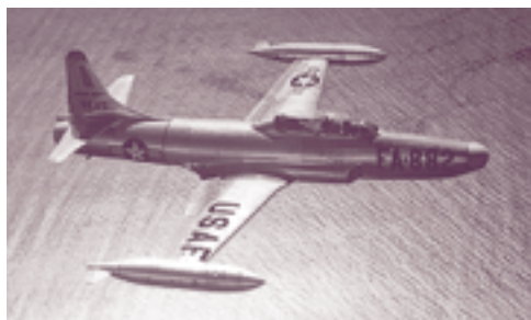
U.S. Air Force Lockheed F-94B Starfire

Faced with the awesome responsibility of defending their countries against nuclear-armed opponents, major air forces gradually adopted a policy of deterrence, akin to Newton's Third Law of Motion – for every action there would always be an equal and opposite reaction. Both sides in a nuclear war would suffer horribly from such massive retaliation. The amount of damage would, however, vary according to the size and quality, in other words, the credibility, of both the attacking bomber force and the defending fighter force.