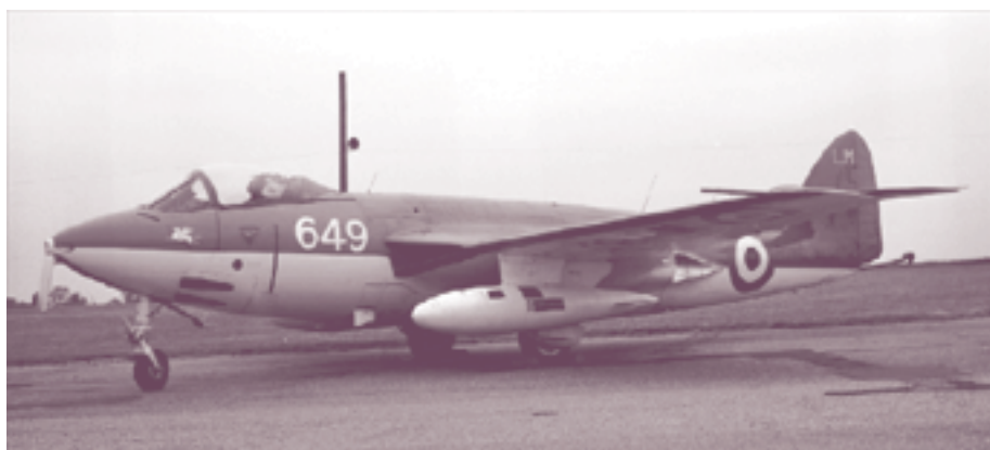
Royal Navy Hawker Sea Hawk F.G.A. Mk.6 (NAM)