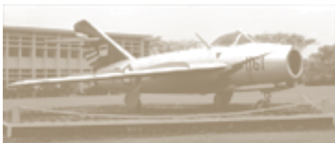
Indonesian air force Mikoyan-Gurevich MiG-17 (NAM)

The introduction of supersonic fighters did not, however, mean the death of their older and slower cousins. The Soviet Union, for example, had developed the Mikoyan-Gurevich MiG-17 to correct the poor characteristics of the earlier MiG-15 at high speed and in tight turns. Ironically, it was the need to mass produce the MiG-15 for air combat in Korea that led to delays in producing the closely-related MiG-17. It finally went into service in the fall of 1954, but just a few months before the first flight of the greatly improved MiG-19.