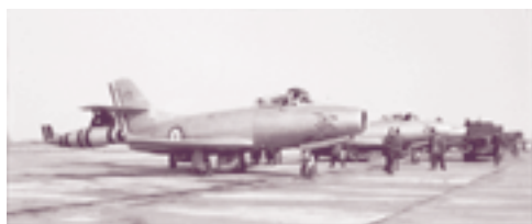
Two Armée de l'Air Dassault MD.450 Ouragans

The French followed a very different route. Rebuilding the country and the armed forces was a matter of national pride after the humiliating defeat of 1940. France's chosen instrument was a company founded by an aircraft designer who had spent most of the Second World War in a concentration camp. Born Marcel Bloch, he changed his name to Marcel Dassault. His first jet fighter was a simple and well-designed machine with just a hint of a sweep in its wing and tail. The Dassault MD.450 Ouragan was powered by a Rolls-Royce Nene built under licence by a famous French aircraft engine maker, Hispano-Suiza. Unspectacular but easy to maintain, the MD.450 Ouragan went into service in early 1952.