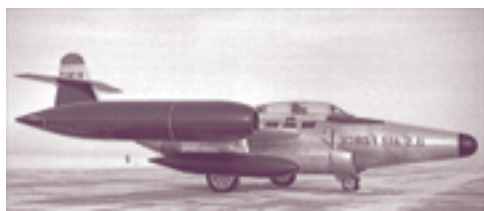
U.S. Air Force Northrop F-89D Scorpion (NAM)