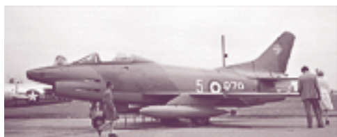
Italian air force Fiat G.91R.1 (NAM)