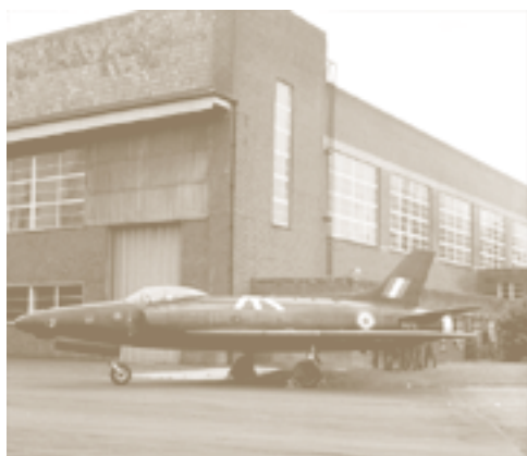
Royal Air Force Supermarine Swift F. Mk.7 (NAM)

The RAF was somewhat better off, but its first home-grown swept-wing fighters, the Hawker Hunter and the Supermarine Swift, entered service only in July and August 1954 respectively. The Hunter was by far the better of the two. Another aircraft designed by Sydney Camm, the Hunter was elegant, manoeuvrable and all but unbreakable. This, along with the airplane's four 30-mm ADEN cannons, led to its wide-scale use as a fighter-bomber. A typical British design, it had only a limited range. The Armstrong Siddeley Sapphire powered early versions of the aircraft. Most Hunters, however, had the Rolls-Royce Avon, an engine also used on airliners like the de Havilland Comet and the SNCASE S.E.210 Caravelle, one of the most elegant designs of the age. Both powerplants clearly illustrated the high level of performance achieved by British aircraft engine designers. Widely exported and used for decades after its first flight, the Hunter was undoubtedly one of the greatest fighters of all time.