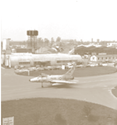
U.S. Air Force North American F-100D Super Sabre (NAM)

As was to be expected, Yeager’s historic flight resulted in efforts to improve fighter performance. The United States, the most advanced nation in the world at the time technically, had a clear advantage. Thus, the first production airplane designed to operate at speeds greater than Mach 1 was a privately-developed project, the North American F-100 Super Sabre daytime fighter. A USAF squadron took delivery of its first aircraft in November 1953. Its massive Pratt & Whitney J57 was one of the best engines of its day, powering aircraft as diverse as the Douglas DC-8 jetliner and the B-52 Stratofortress. The F-100 carried four 20-mm Pontiac M39 cannons, a weapon loosely based on Mauser’s MG213C 30-mm cannon. Unlike the French or the British, the Americans stuck with 20-mm ammunition, in part because it was readily available. They also believed that cannons were obsolescent and would be replaced by rockets and missiles within a few years.