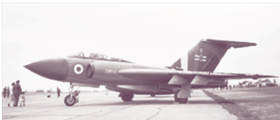
Royal Air Force Gloster Javelin F.(AW) Mk.8 (NAM)

To keep up with their intended targets, all-weather fighters eventually had to leave these straight wings behind. One of these aircraft was the Yakovlev Yak-25, the first machine of this type to be produced for the Soviet military. Fitted with a bicycle-type undercarriage comparable to that of the Boeing B-47 Stratojet medium range bomber, this solid machine may have been the first swept-wing all-weather fighter to go into service, in 1955. In Great Britain, engineers developed the Gloster Javelin, the world's first twin-engine two-seat, delta wing aircraft and one of the most distinctive fighters of the 1950s. The design of its triangular wing was based on German research seized after the Second World War. With its large area and internal volume, this huge wing provided plenty of space for the landing gear, as well as fuel and weaponry. The first production aircraft were issued to a squadron in February 1956. Although pleasant to fly, the Javelin was slow and the multitude of versions did not facilitate the work of maintenance crews.