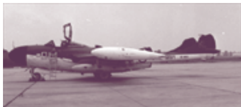
Royal Navy de Havilland Sea Venom F.A.W. Mk.22

All aircraft are critically dependent on the performance and quality of their engines. The failure of the F4D Skyray's original engine, the Westinghouse J40, had been an irritant to Douglas engineers. At McDonnell Aircraft, that same failure brought to a virtual standstill the production of the company's first swept-wing design, the F3H Demon. First delivered to a squadron in March 1956, the new airplane was still underpowered and proved disappointing. All three airplanes were fitted with four 20-mm cannons. In addition, the F7U Cutlass could carry a belly tray with thirty-two 69.9-mm "Mighty Mouse" rockets.