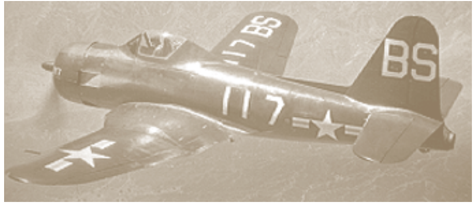
U.S. Navy Ryan FR-1 Fireball

Because of the slow acceleration and poor takeoff and landing characteristics of the early jets, naval air arms were slower to adopt the new technology. Still, the U.S. Navy flew some straight-wing jet fighters, like the McDonnell FH Phantom, the North American FJ Fury and the Ryan FR Fireball (a hybrid type with both piston and jet engines). Their British counterpart was the de Havilland Sea Vampire, a navalized version of the Vampire.