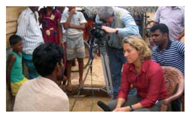
Adrienne Arsenault reporting from Sri Lanka for CBC Television and CBC Newsworld

CBC | Radio-Canada is a shareholder in TV5Monde, an international network available to 263 million households in 203 countries and territories worldwide, and which draws over 173 million viewers each week (cumulative audience). TV5Monde annually broadcasts 400 hours of Télévision de Radio-Canada programming, including Le téléjournal; Découverte; Catherine; Un gars, une fille; Grande Ourse; and Ciao Bella . The feature films La femme qui boit; 20 h 17, rue Darling , and Québec-Montréal were seen across the entire TV5Monde network in 2005. Le point is a Current Affairs program specially packaged for TV5Monde, with reports from the programs Enjeux, Zone libre and Le point . During prime time, TV5Monde also airs an international version of 5 sur 5 . Télévision de Radio-Canada hosted a seminar in Montréal on documentaries, organised by the Communauté des Télévisions Francophones (CTF), which brought together CTF-member public television services, as well as producers, directors and scriptwriters from Belgium, Switzerland, France, and Canada. During the year, TV5Monde rebroadcast a number of Radio-Canada News specials, such as the leaders' debate, the results of the 2006 federal election, national and provincial celebrations, and major cultural events such as the ADISQ gala and the Soirée des Jutra.