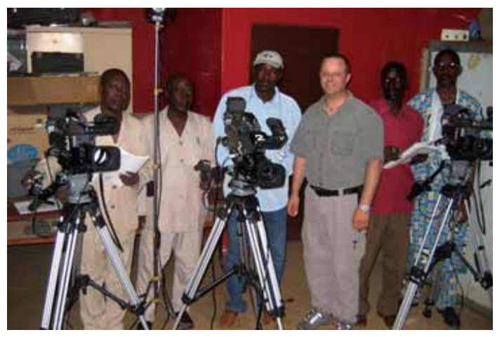
Students of CBC | Radio-Canada's Canadian Institute for Training in Public Broadcasting, learning television production in Niger, in preparation for the Jeux de la Francophonie

In 2005, Radio de Radio-Canada signed a major agreement with Radio France Internationale (RFI) allowing the Première Chaîne to air a live daily newscast as well as a weekly selection of RFI's top arts and entertainment shows. Each day, RFI's Paris station carries a best-of compilation of Première Chaîne programming, packaged by Radio de Radio-Canada. To mark the launch of Info plus on Sirius Canada, Radio de Radio-Canada reached an agreement bringing Canadians morning shows from France Inter, Radio France's flagship network.