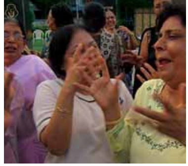
Passion and Fury: The Emotional Brain, The Nature of Things, CBC Television and CBC Newsworld