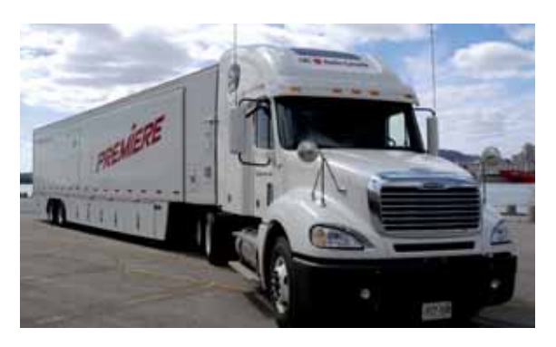
High Definition Mobile Truck

In November 2005, CBC Television created a Video Syndication (VS) unit within CBC's Digital Programming and Business Development group, in order to satisfy the growing demand for content on new platforms – from cable video-on-demand, to the Internet (on CBC.ca and commercial portals), to private and public screens, to cellular and other mobile devices. The VS unit will develop programming strategies for