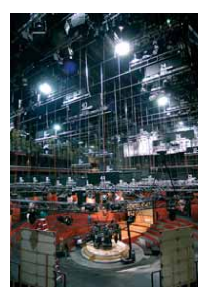
Set for The Greatest Canadian , Studio 40, Canadian Broadcasting Centre, Toronto

A creative organisation needs to provide a healthy environment in which creativity can flourish. Following the Corporation's employee surveys of 2001 and 2004, CBC | Radio-Canada Management and Unions recognised the need to act on certain employee-related wellness issues cited in the survey findings, and Human Resources is