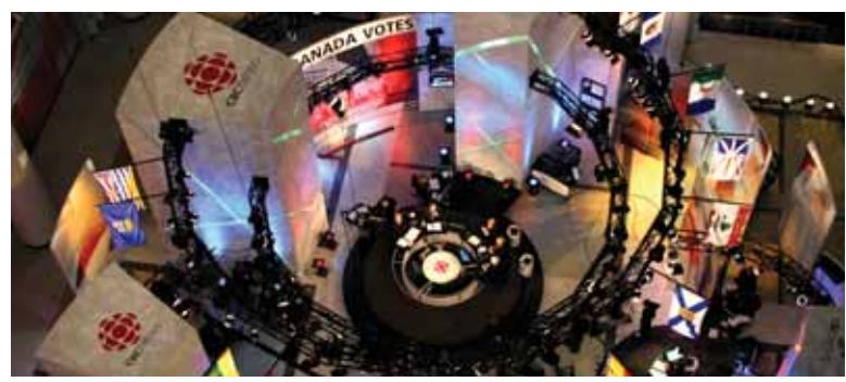
Canadian Broadcasting Centre, Toronto