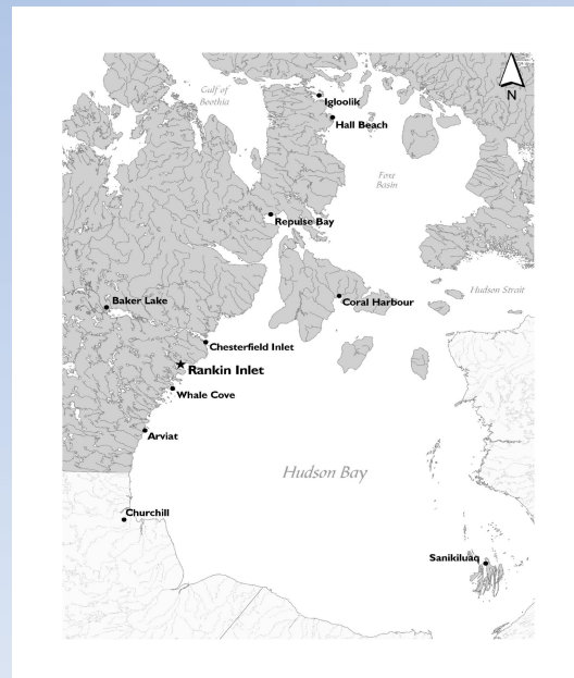
(For larger map use zoom tool)

Getting there: Flights to Rankin Inlet are operated by First Air and Canadian North on Mondays, Wednesdays and Fridays. It is possible to reach Rankin Inlet in one day from either Ottawa/Montreal--via Iqaluit, or Edmonton/Calgary--via Yellowknife. Kivalliq Air operates flights every day of the week except Saturday from Winnipeg to Rankin Inlet, with a stop in Churchill; Calm Air flies to Rankin Inlet from Monday to Saturday, with stops in Churchill and Arviat. First Air flies directly from Winnipeg to Rankin Inlet on Sunday, Tuesday and Thursday.