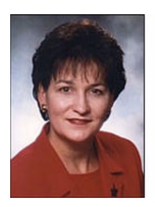
Susan Whelan Minister for International Co-operation

As I embark on this new assignment as Minister for International Co-operation, two elements help to transform what could be a daunting task into an inviting prospect. The first is history — the time, talent and thinking that has gone into setting international development priorities and refining international development practice based on the lessons of the last half century. I am naturally pleased at the contribution by CIDA, and more broadly by Canada, to this process.