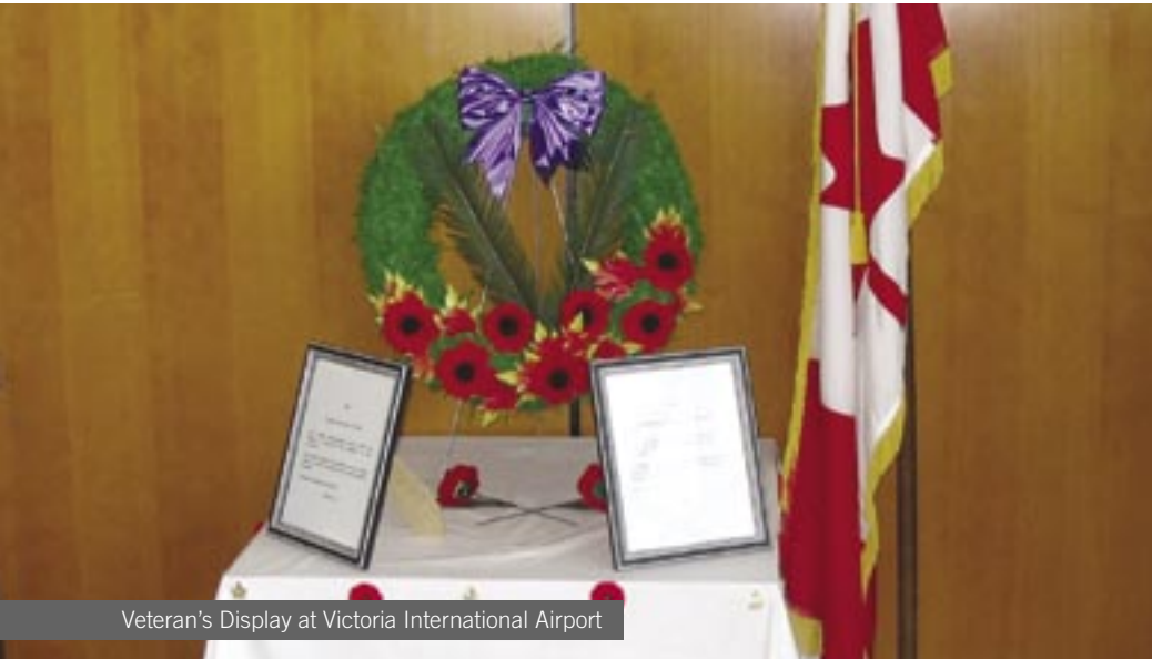
Veteran's Display at Victoria International Airport

As mentioned in a previous article, 2005 was declared by the Government of Canada as The Year of the Veteran. CATSA participated in various activities throughout the year commemorating this important milestone.