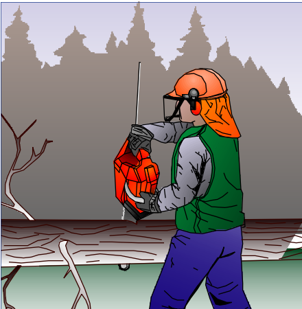
NEVER backcut pulling the blade towards yourself.

A 26-year-old woodcutter died as a result of injuries sustained while he was using a chainsaw to remove the limbs and top of a felled tree.