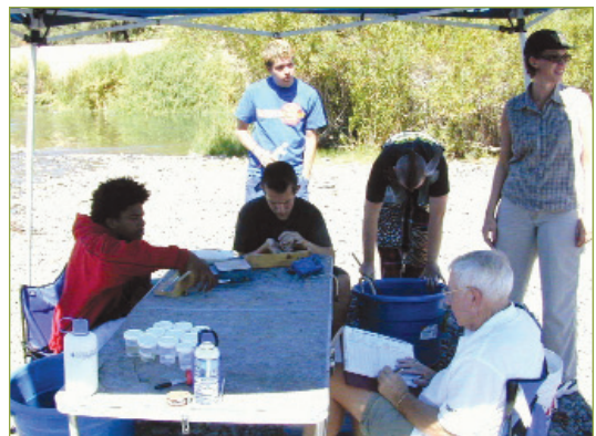
Volunteers assist with data collection.

Use of volunteer service can provide cost savings on projects, public education, political support, a network of expertise, and allow graduate