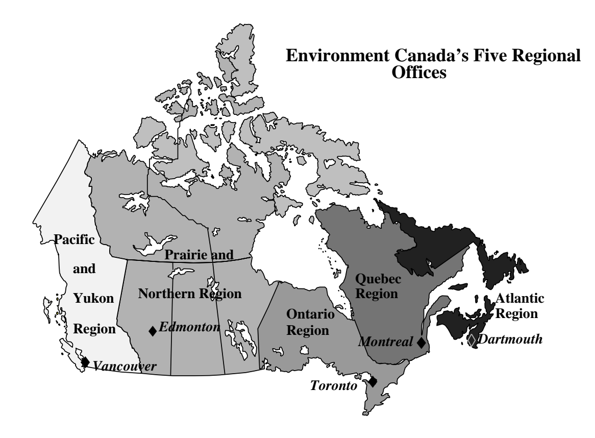
Map 2: Environment Canada's Regions and Offices

2001-2002 Annual Report to Parliament on the Administration and Enforcement of the Fish Habitat Protection and Pollution Prevention Provisions of the Fisheries Act .