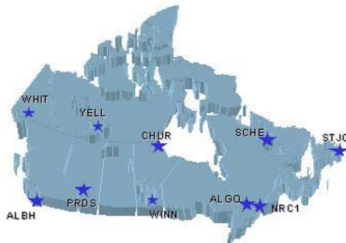
Figure 1. Current Real-Time GPS-C Automated GPS Tracking Stations

The correction information is derived utilizing Geodetic Survey Division of Natural Resources Canada's real-time component of the Canadian Active Control System referred to as GPS•C. This GPS•C infrastructure includes high quality GPS tracking stations located across Canada (Figure 1). Each tracking station (Active Control Point) includes a state of the art dual frequency GPS receiver, a high precision frequency standard, a networked workstation with real-time application software and a high-speed communication link. [Caissy et al, 1996] A real-time master active control station (RTMACS) controls the network of ACP's, manages the data and computes the GPS•C correction information.