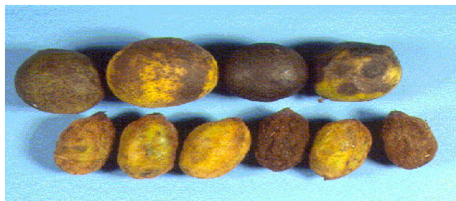
Fruits of butternut and walnut infected with Sirococcus clavigignenti-juglandacearum .

Innes, L. 1998. Sirococcus clavigignenti-juglandacearum on butternut and black walnut fruit. pp 129-132 in G. Laflamme, J.A. Berube, R.C. Hamelin, editors Foliage, shoot and stem diseases . Proceedings of the IUFRO WP 7.02.02 meeting, Quebec City, May 25-31, 1997. Natural Resources Canada, Canadian Forest Service, Sainte-Foy, Quebec. Info.Rep. No. LAU-X-122.