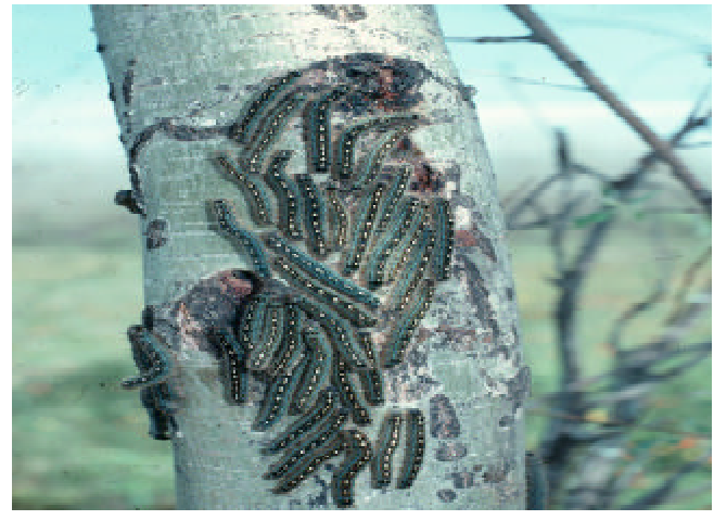
Forest tent caterpillar larvae

usually located in trees, but can often be found on other stationary objects such as buildings and fences. Adult moths emerge 7 to 10 days later. The adult moth is buff colored and