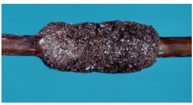
Forest tent caterpillar eggs

The forest tent caterpillar overwinters in an egg band on the twigs of host trees. The eggs are extremely hardy and easily survive Canadian winters. Eggs hatch in the early spring about the time of bud break when the leaves unfold. The caterpillars have five growth stages called instars, each stage lasts 7 to 10 days. Mature caterpillars are about 45-55 mm long and develop a deep blue velvet coloration with a sparse covering of long brown hair. A line of white to cream-colored keyhole-shaped spots run down the back. Once feeding has finished, the caterpillars spin silk cocoons with white/yellow threads in which they begin to pupate. These cocoons are